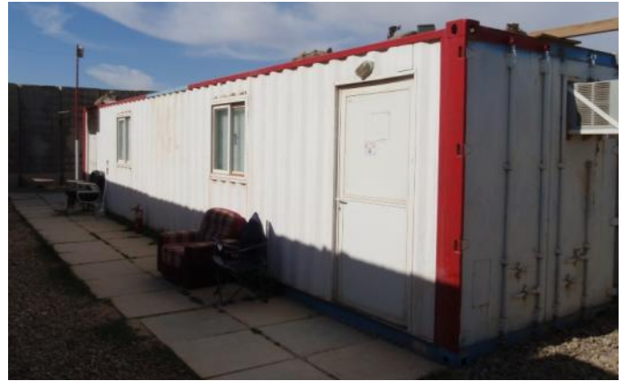
40 MILVAN CHU with curious exterior furnishings

rows separated by walls to provide compartmentalized blast protection from indirect fire. They look like an out of place ship yard in the desert but comfortable house several companies worth of troops. Regardless of their appearance, they became an instant hit with the deployed service members who were mainly living in tents and captured Iraqi Army facilities. The first units remain easily recognizable as they still contain their original cargo doors. They were highly