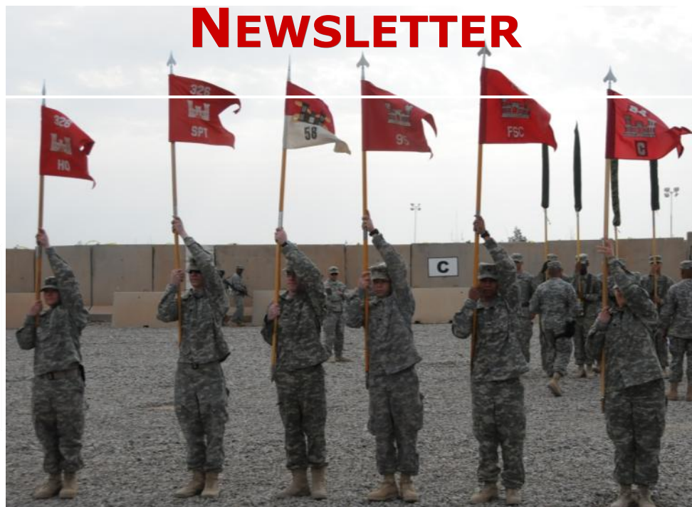
Guidon's reach for the sky as 65th and 326 EN BN Soldiers rehearse for the Transition of Authority (TOA) ceremony, COB Speciber, Iraq

Left: The 130th Engineer Brigade Insignia Right: 18th Engineer Brigade Insignia; Insignia worn by the Task Force Trailblazer's new higher HQ who are based out of Campbell Barracks in Heidelberg, Germany.