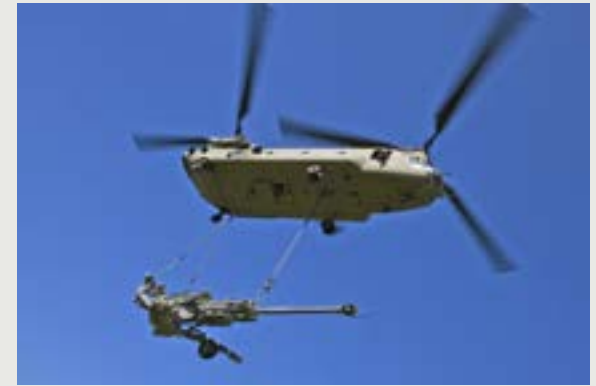
FA, 2CR sling load training

A U.S. Army 12th Combat Aviation Brigade CH-47 Chinook helicopter carries an M777A2 howitzer assigned to Alpha Battery, Field Artillery Squadron, 2nd Cavalry Regiment, during an air assault mission at the 7th Army Training Command's Grafenwoehr Training Area, Germany, May 7, 2020.