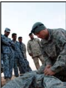
10th CAB Medic Takes Initiative- page 20