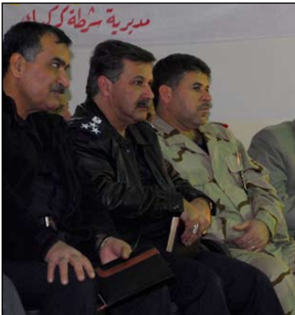
Local police and Iraqi Army leadership ask the panel questions during the Criminal Justice Council conference Dec 31 at the Iraqi Police Academy in Kirkuk City, Iraq.

"It is the beginning of a new year, but it is also the dawning of a new day for Iraq."