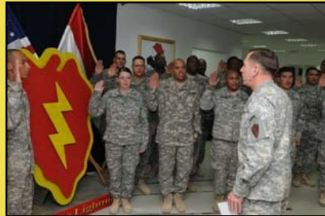
Gen. David H. Petraeus, commanding general, U.S. Central Command, administers the U.S. military Oath of Re-enlistment to re-enlisting Soldiers at Contingency Operating Base Speicher, Dec. 25.

So why do Soldiers reenlist? Though there have not been any recent studies made which connect the recent decline of the economy to the increase in reenlistment rate; most Soldiers will state the obvious when speaking about their decision to raise their right hand. Many MND-N Soldiers, in serving Northern Iraq, are more actively involved in improving the economy of the beleaguered nation of Iraq. Still, the benefits are very apparent to some.