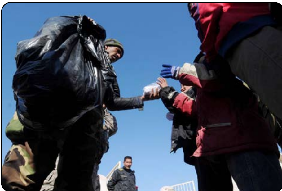
A member of the Sons of Iraq hands out T-shirts to students during a ceremony officially opening the new school in the village of Atshiyana, Kirkuk Province, Iraq Jan. 12. The Sons of Iraq provided shirts, pencils and notebooks for the children to use and wear while attending classes at the school.