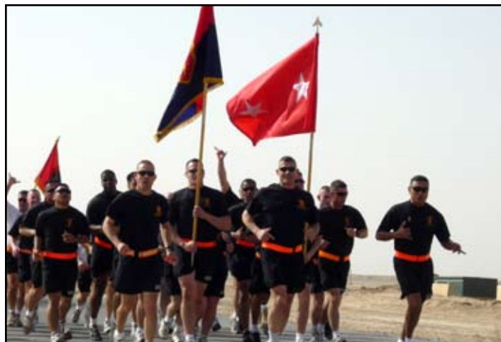
More than 1,000 Soldiers from the 25th Infantry Division, other service members and civilians, ran six miles in the Operation Iraqi Freedom Great Aloha Run, Feb. 8, to mirror the 25th annual Great Aloha Run that will take place Feb. 16 in Honolulu.

Units that participated in the 2009 OIF Great Aloha Run included the 25th Inf. Div. headquarters staff, the 3rd Inf. Bde. Combat Team, the 10th Combat Aviation Bde. and the 75th Fires Bde., among others. Soldiers from the 3rd Inf. Bde. Combat Team ran an extra 2.15 miles, to match the length of the race in Hawaii.