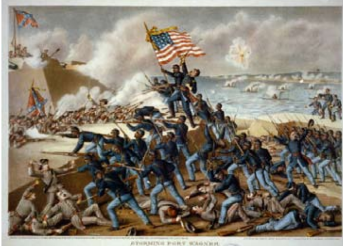
"Storming Fort Wagner," A portrait commemorating the bravery and sacrifices of the 54th Massachusetts Volunteer Infantry Regiment during their assault on Fort Wagner at Morris Island, Charleston, S.C., July 18, 1863, now hangs at the 54th Massachusetts Volunteer Regiment Headquarters.