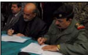
SOI Transfer Made Official in Diyala - page 14