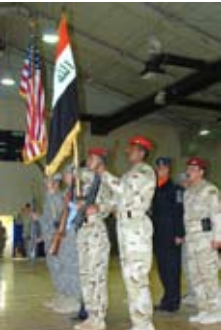
Blackjack Brigade Partners with ISF at FOB Warrior - page 19