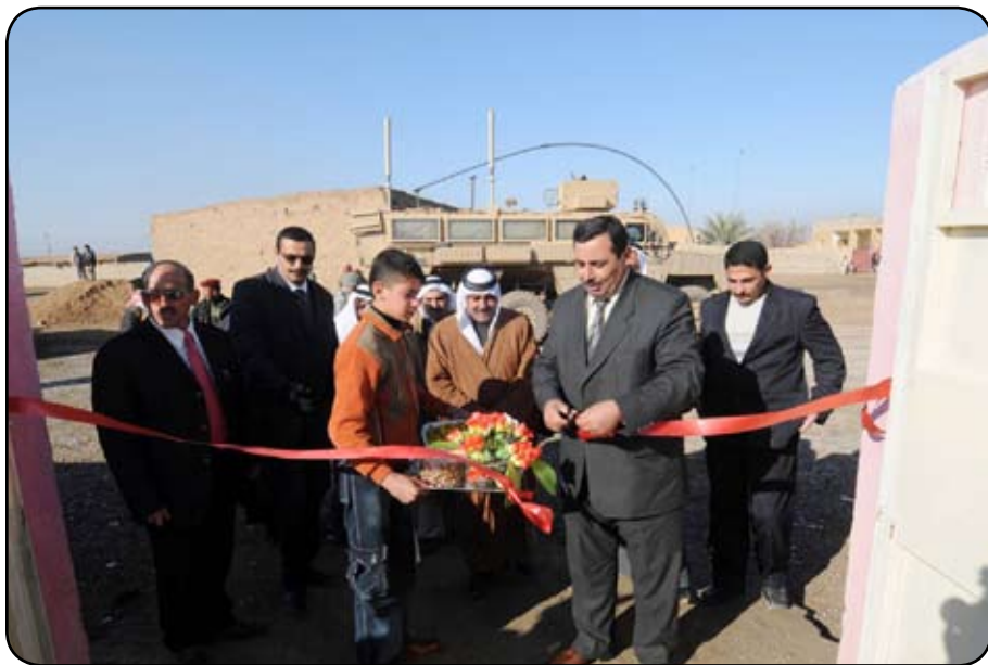
The Mayor of Atshiyana Village cuts the ribbon to officially open a newly constructed school in Kirkuk Province, Iraq Jan. 12.

This school construction, a project under the Iraqi Commander's Emergency Relief Program, is part of many efforts to come for rebuilding and expanding the education system all around the area. Although there are many school projects taking place around the province, this school is unique in the region because of where it was built.