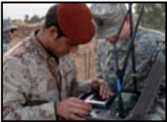
Send in the Robots! - page 7