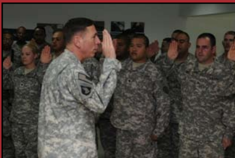
Gen. David H. Petraeus, commanding general, U.S. Central Command, and a key figure in the Coalition Force progress in Iraq, thanked all Soldiers who committed to continuing service of their country on Christmas morning, Dec. 25, 2009.

Our Soldiers today are dedicated, committed, and they do what they do as an All Volunteer Force.