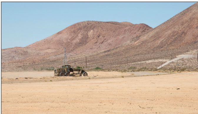
A road grading machine with a 7th ESB Marine behind the controls does its dusty work leveling 20 acres of desert land outside the fenceline behind the Mounted Color Guard stables on the Yermo Annex of Marine Corps Logistics Base Barstow, Aug. 19, 2019. The land is intended for use as a bivouac area for visiting Marine Corps units engaged in training.