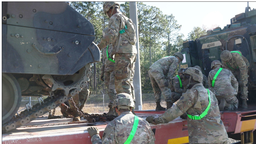
Soldiers with the 1st Armored Brigade Combat Team, 3rd Infantry Division, chain down armored vehicles to a railcar at the Rail Marshalling Area, Fort Stewart, Ga., Dec. 18, 2019.