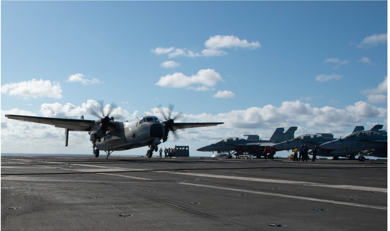
A C-2A Greyhound, assigned to the “Rawhides” of Fleet Logistics Support Squadron (VRC) 40, lands on the flight deck.

Squadrons assigned to Carrier Air Wing (CVW) 3 flew aboard the aircraft carrier USS Dwight D. Eisenhower (CVN 69) Sept. 9, for carrier qualifications as part of Tailored Ship’s Training Availability/Final Evaluation Problem (TSTA/FEP).