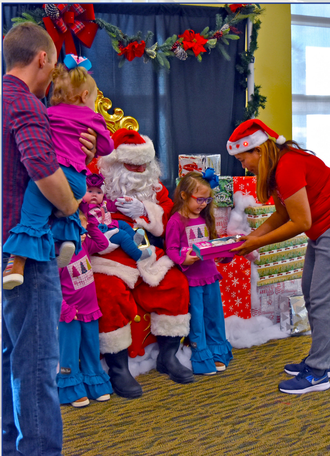
Santa's little helpers provide free toys to children after they have taken pictures with Santa at the Breakfast with Santa event at Dewey's on NAS Jax, Dec. 14.