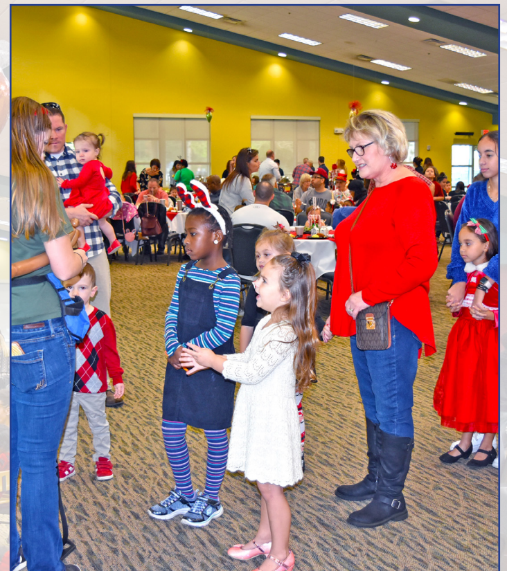
Children await their turn for a holiday-themed balloon creation at the Breakfast with Santa event at Dewey's on NAS Jax, Dec. 14.