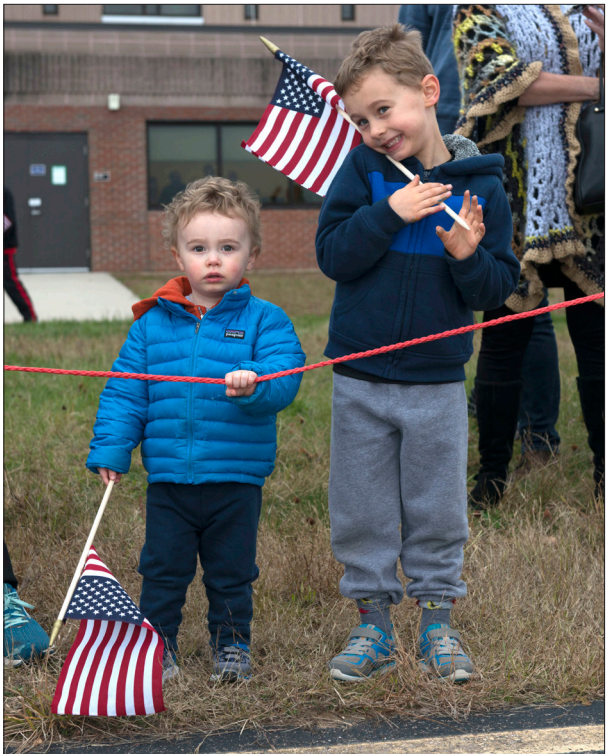
Children await the return of Connecticut Air National Guardsmen to Bradley Air National Guard Base from a deployment to Kuwait, November 5, 2019, in East Granby, Conn. Members of the 103rd Airlift Wing deployed to Kuwait in support of Operation Inherent Resolve and Operation and Operation Spartan Shield.