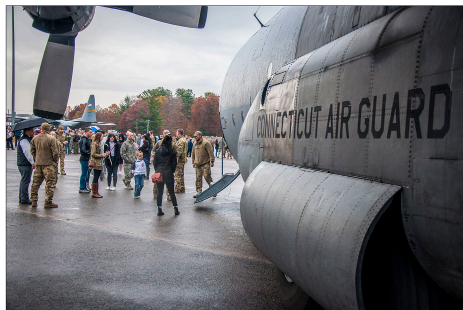
Airmen assigned to the 103rd Airwing reunite with their families at Bradley Air National Guard Base, Nov. 7, 2019. The 103rd Air Wing returned from a four month deployment to Kuwait in support of Operations Spartan Shield and Inherent Resolve.