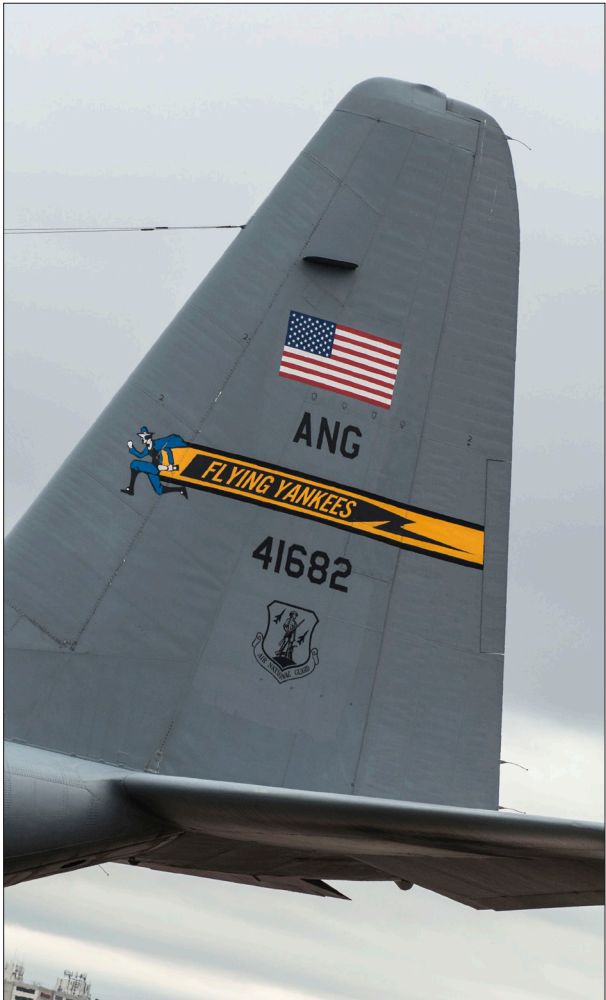
The tail of a C-130H Hercules that returned to Bradley Air National Guard Base from a deployment to Kuwait, November 5, 2019, in East Granby, Conn.