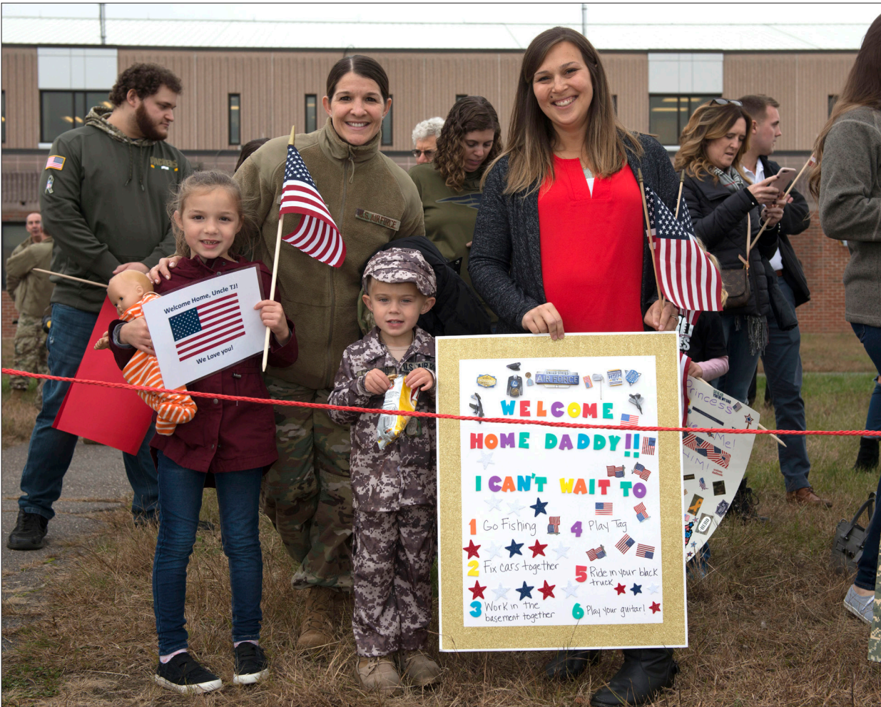
A family awaits the return of Connecticut Air National Guardsmen to Bradley Air National Guard Base from a deployment to Kuwait, November 5, 2019, in East Granby, Conn. Members of the 103rd Airlift Wing deployed to Kuwait in support of Operation Inherent Resolve and Operation and Operation Spartan Shield.