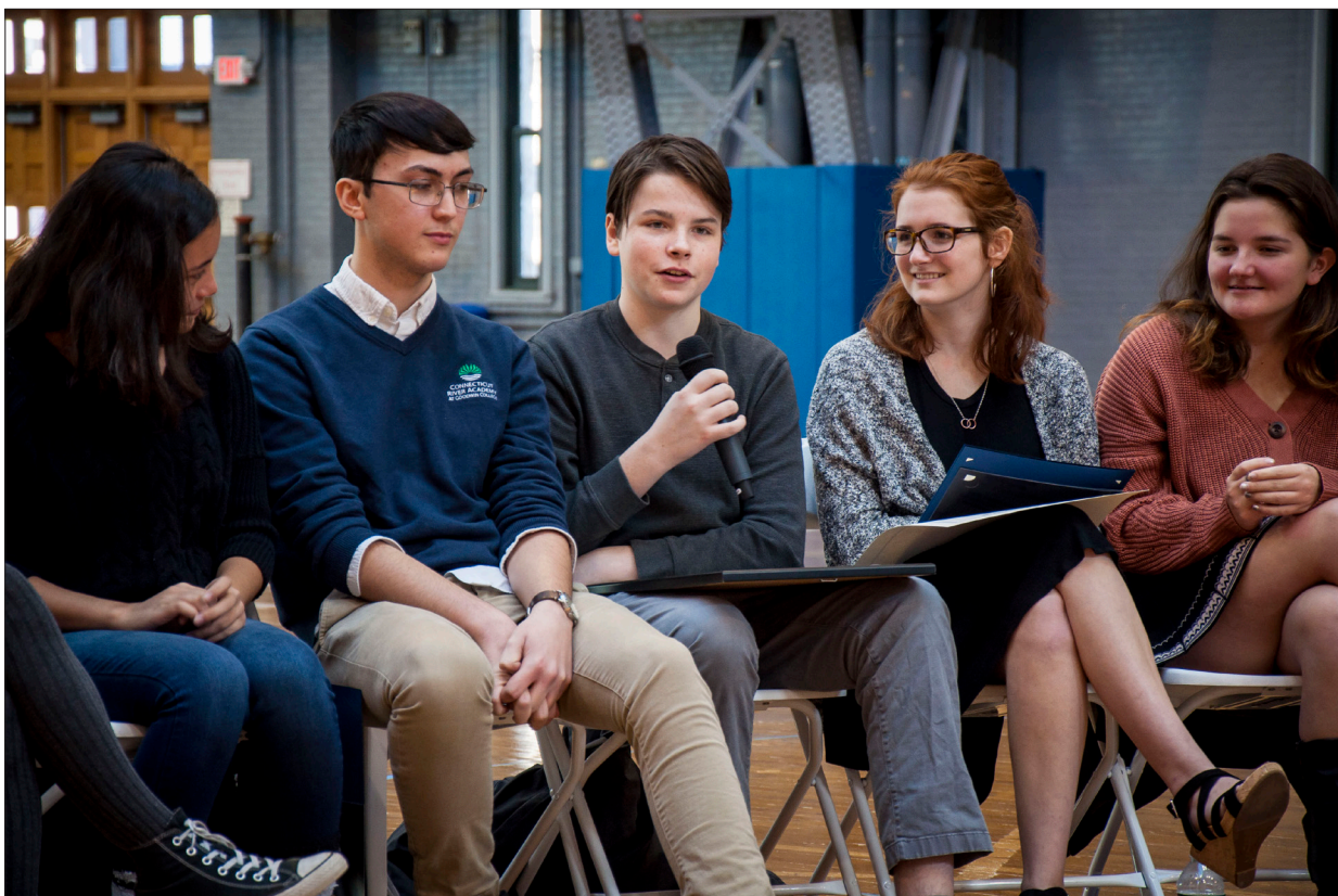
Connecticut students share their experiences participating in the Digging Through History program, a three-week summer student ambassadorship to Seicheprey, France, at the William A. O'Neill State Armory in Hartford, Conn. Nov. 19, 2019. The students worked alongside French students to help restore WWI trenches used by Connecticut's 102nd Infantry Regiment during the war.