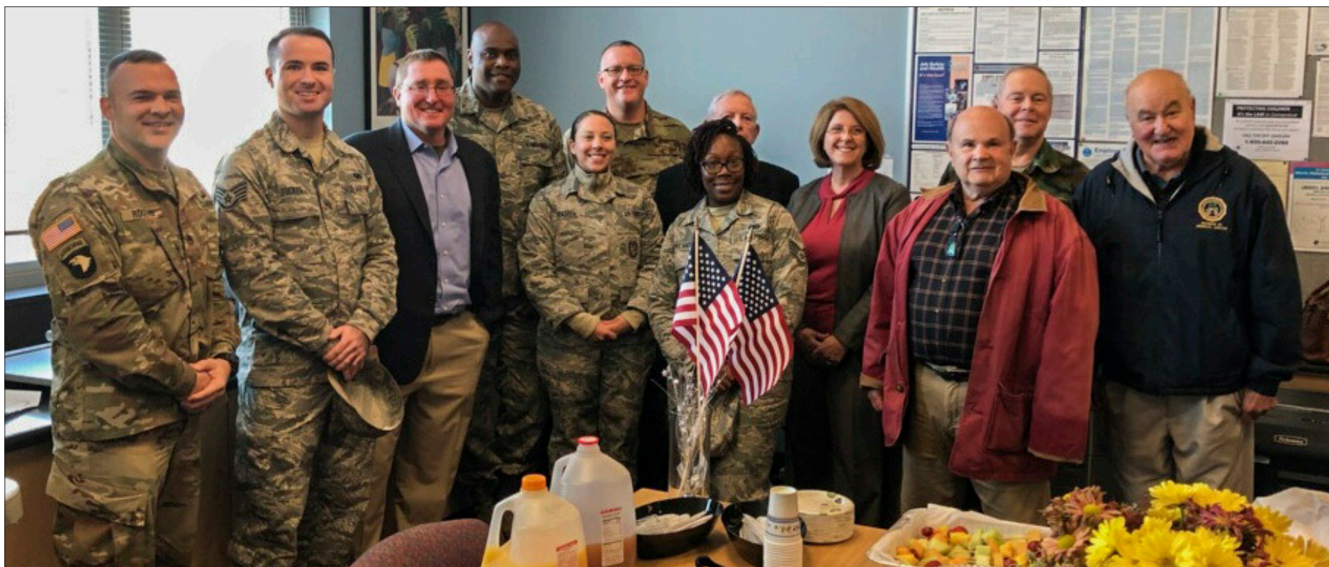
Airmen from the 103rd Airlift Wing join other service members and veterans from the local community for Granby Memorial High School's Veterans Day and Service Men and Women Recognition event Wednesday, Nov. 6 in Granby, Conn. The annual event features a reception for participants and pairs them with student groups for question and answer panels about their experiences in military service.