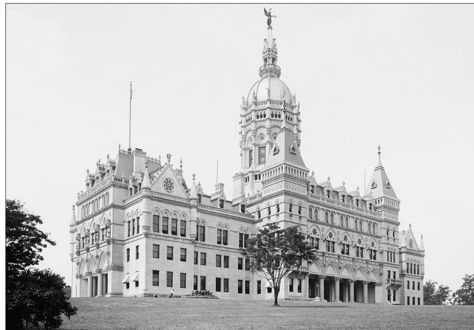
State House, Hartford, Conn.