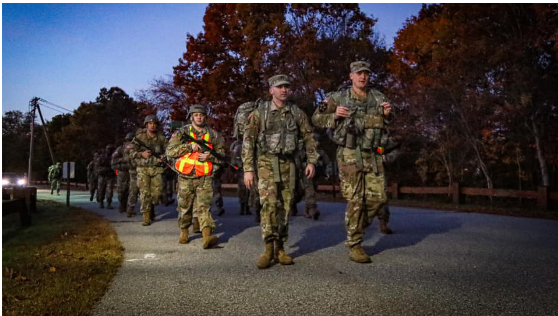
Officer Candidates with 1-169 conduct a road march as part of their monthly drill training.