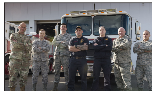
Bradley firefighters' aid response to B-17 crash Page 26