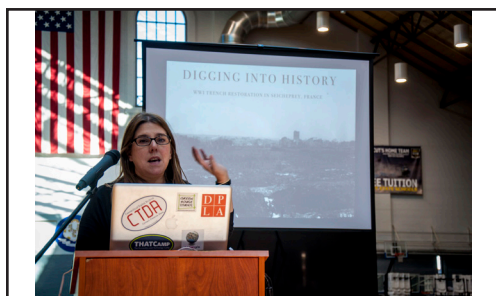
Digging Into History Page 4