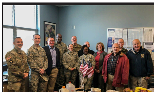
Airmen visit students for Veterans Day Page 14