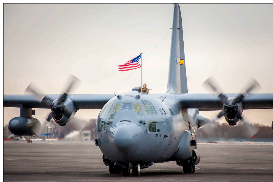
An airmen from the 103rd Air Wing holds an American flag out of the hatch C-130 Hercules aircraft after it landed at Bradley International Airport, Nov. 7, 2019. The 103rd Air Wing returned from a four month deployment to Kuwait in support of Operations Spartan Shield and Inherent Resolve.