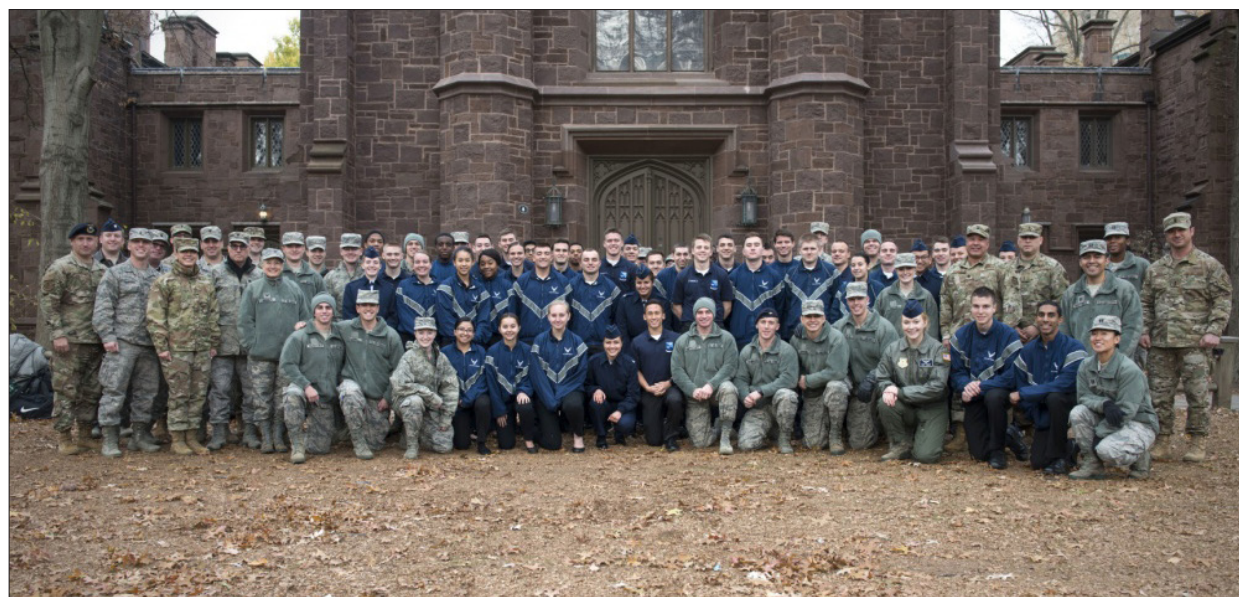
Air Force ROTC cadets assigned to Detachment 009 at Yale University, pose for a group photo with active Air Force Officers outside of Yale's Linsly-Chittenden Hall November 14, 2019. A panel discussion, led by the officers, was held to meet ROTC training objectives, which require cadets to gain exposure to the operational Air Force environment by interacting with active Air Force members.