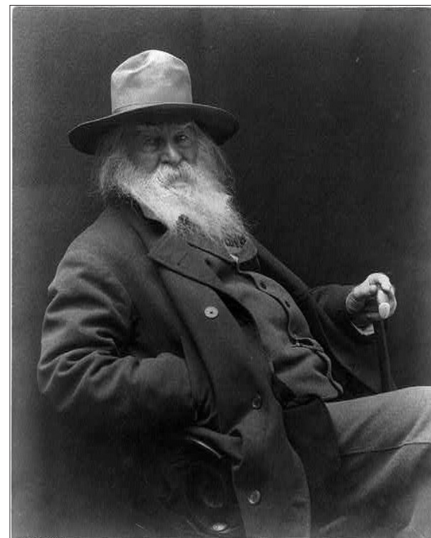
Walt Whitman, 1819-1892; Library of Congress Control Number: 2004677282

Whitman wrote that his work as a nurse was "the greatest privilege and satisfaction... and, of course, the most profound lesson of my life."