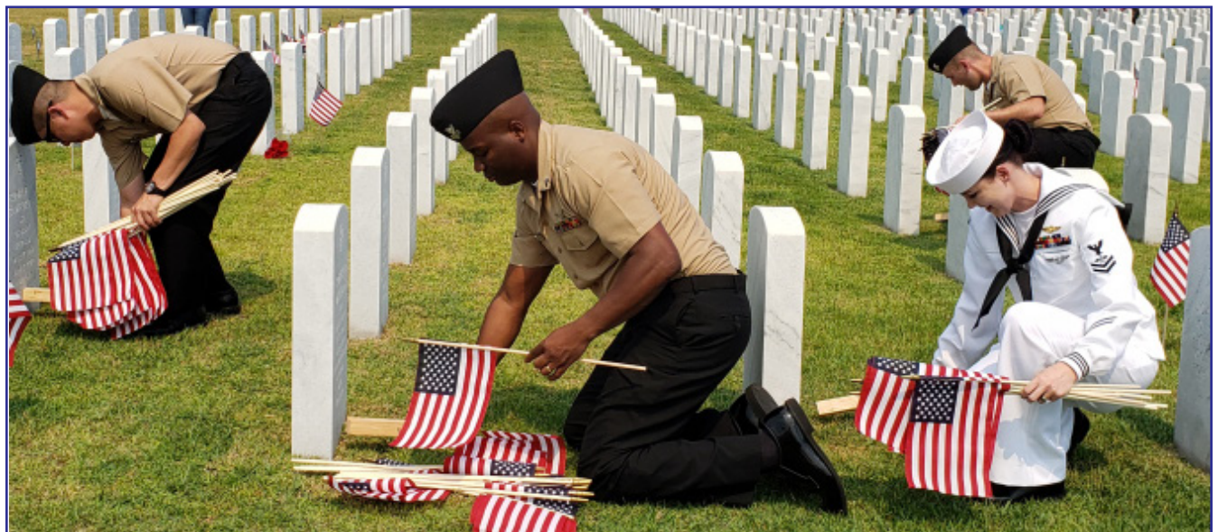
Naval Air Station Jacksonville Sailors place flags at the graves of local veterans in honor of Memorial Day, May 23.