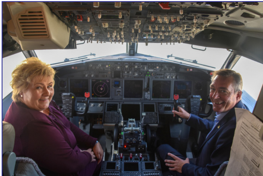
Norwegian Prime Minister Erna Solberg and Norwegian Defense Minister Frank Bakke-Jensen sit at the cockpit of a P-8A Poseidon at Patrol Squadron 30 during their visit to Naval Air Station Jacksonville.