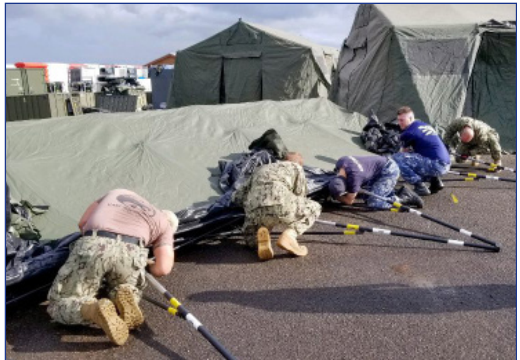
Sailors assigned to Mobile Tactical Operations Center Three and members of the Royal Australian Air Force assemble tents in preparation for support to Talisman Sabre 2019, July 25.