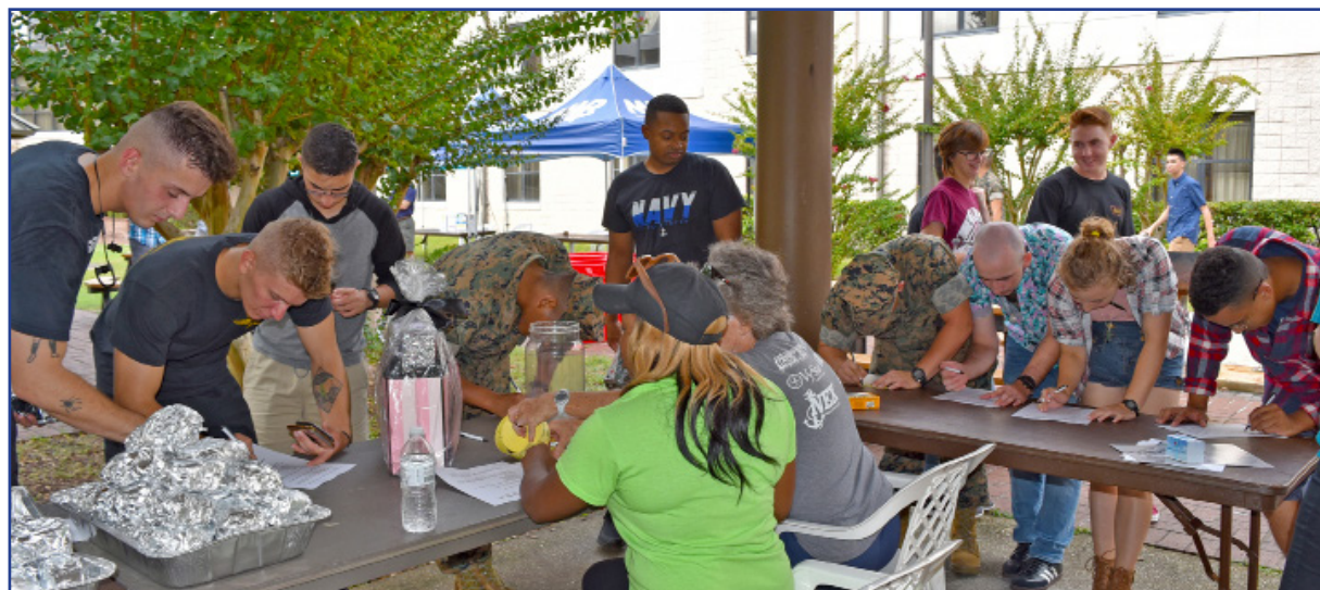
NAS Jax service members gather in the Barracks Courtyard to sign up for prizes and giveaways from the Liberty Center and other MWR facilities at the Barracks Crash on Sept. 19.