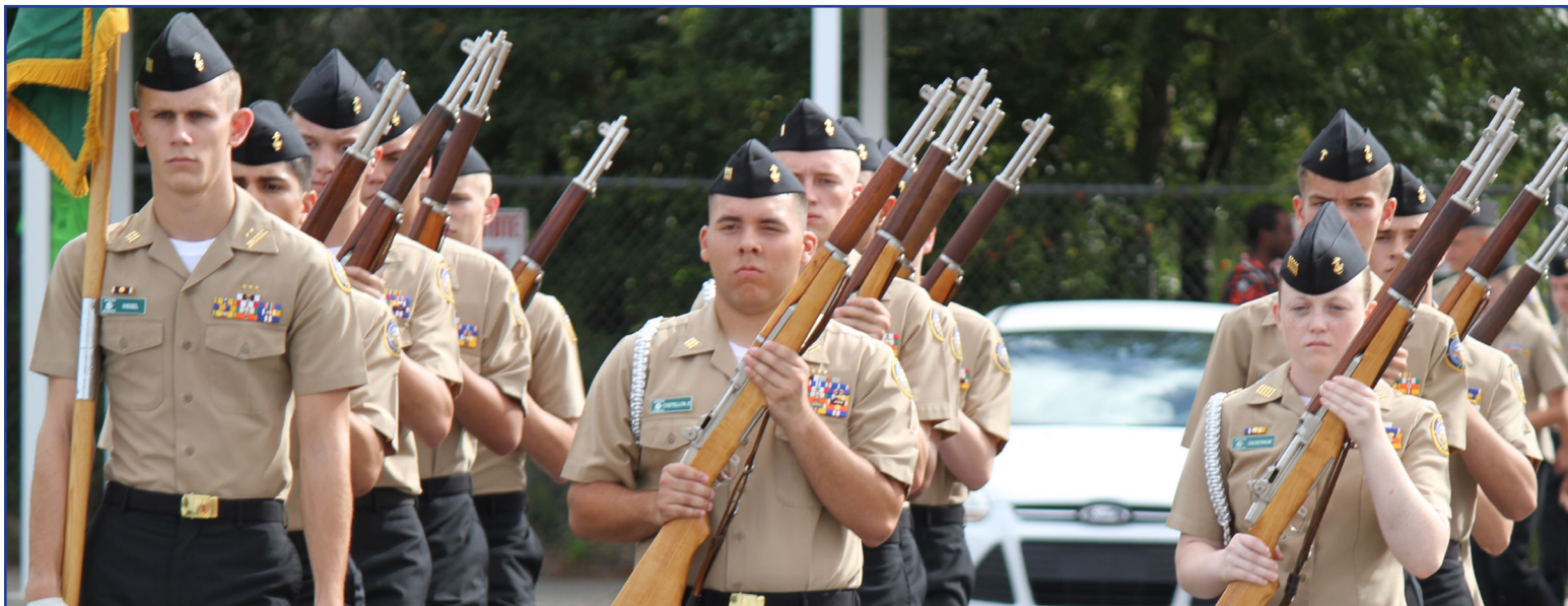
Nease High School NJROTC's Armed Basic team competes during the Mandarin Drill Meet, Oct. 26. Nease went on to win the event.