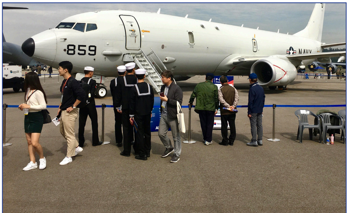
Korean nationals and members of the Republic of Korea Navy observe a static display of the P8A Poseidon at the Seoul International Aerospace and Defense Exhibition in Seoul, South Korea, Oct. 22.