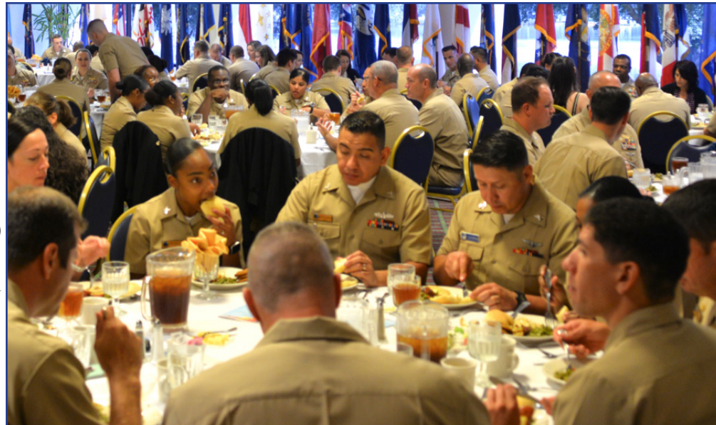
Sailors, their leadership, and families gather at the Sailor of the Quarter luncheon held at the River Cove Catering and Convention Center at Naval Air Station Jacksonville, Oct. 30.