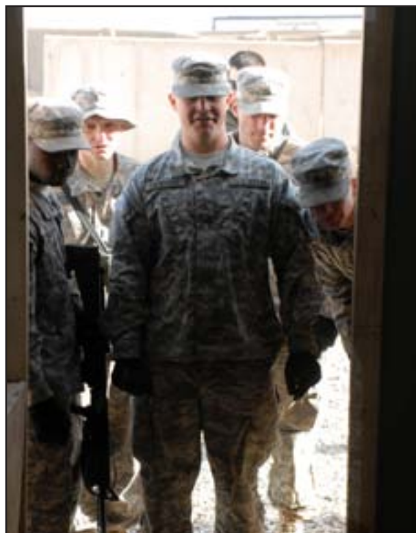
Soldiers with 2nd Platoon, 87th Engineers Company, 5-55th Engineer Brigade, evaluate a house before clearing it of any possible improvised explosive devices during a training exercise at Forward Operating Base Warhorse in Diyala, Iraq, Jan. 9.