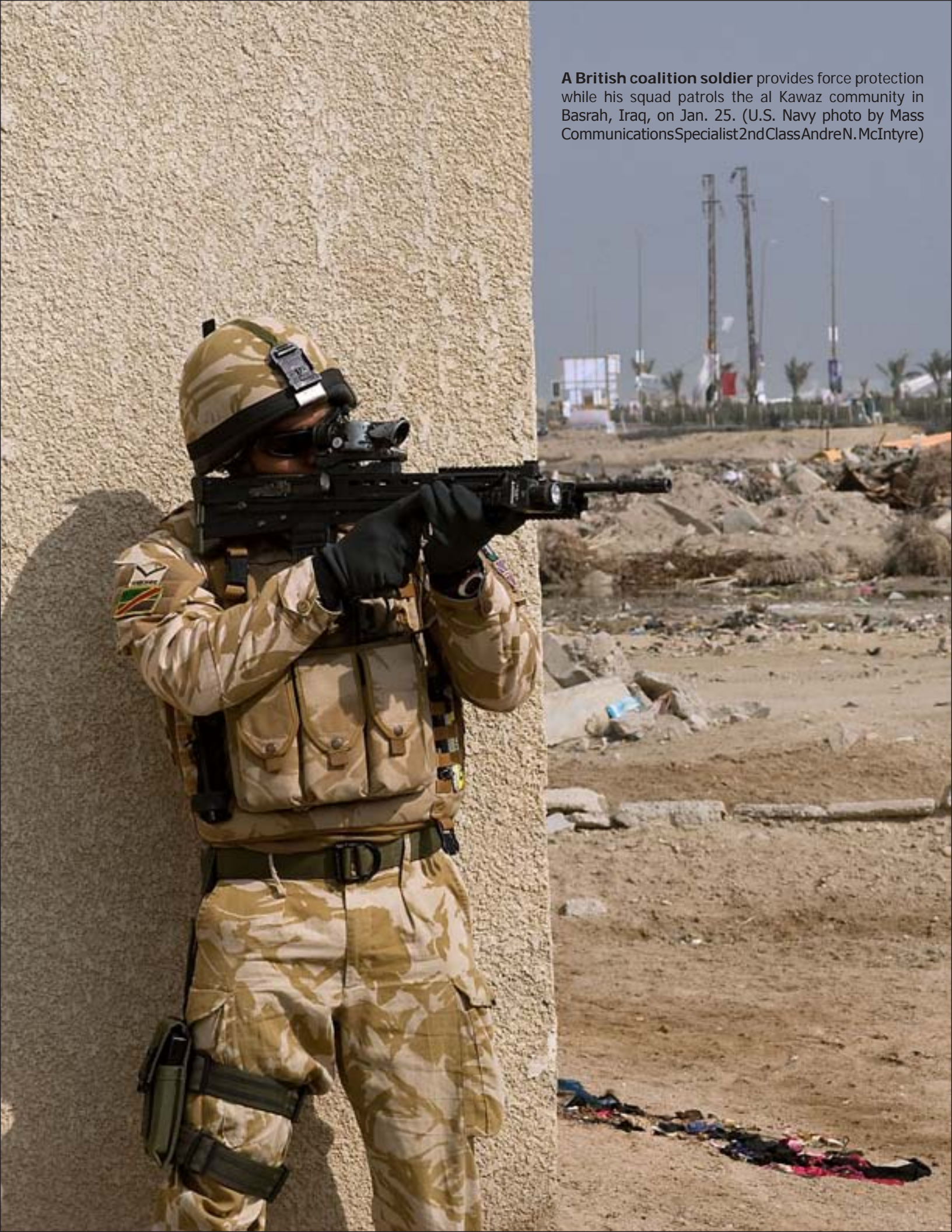
A British coalition soldier provides force protection while his squad patrols the al Kawaz community in Basrah, Iraq, on Jan. 25.