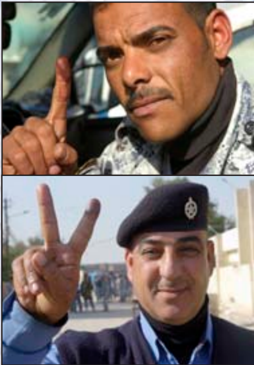
A National Police officer and an Iraqi Police officer giving a "peace" sign, show off their ink-stained fingers after leaving a polling station Jan. 28 in the New Baghdad district of eastern Baghdad.