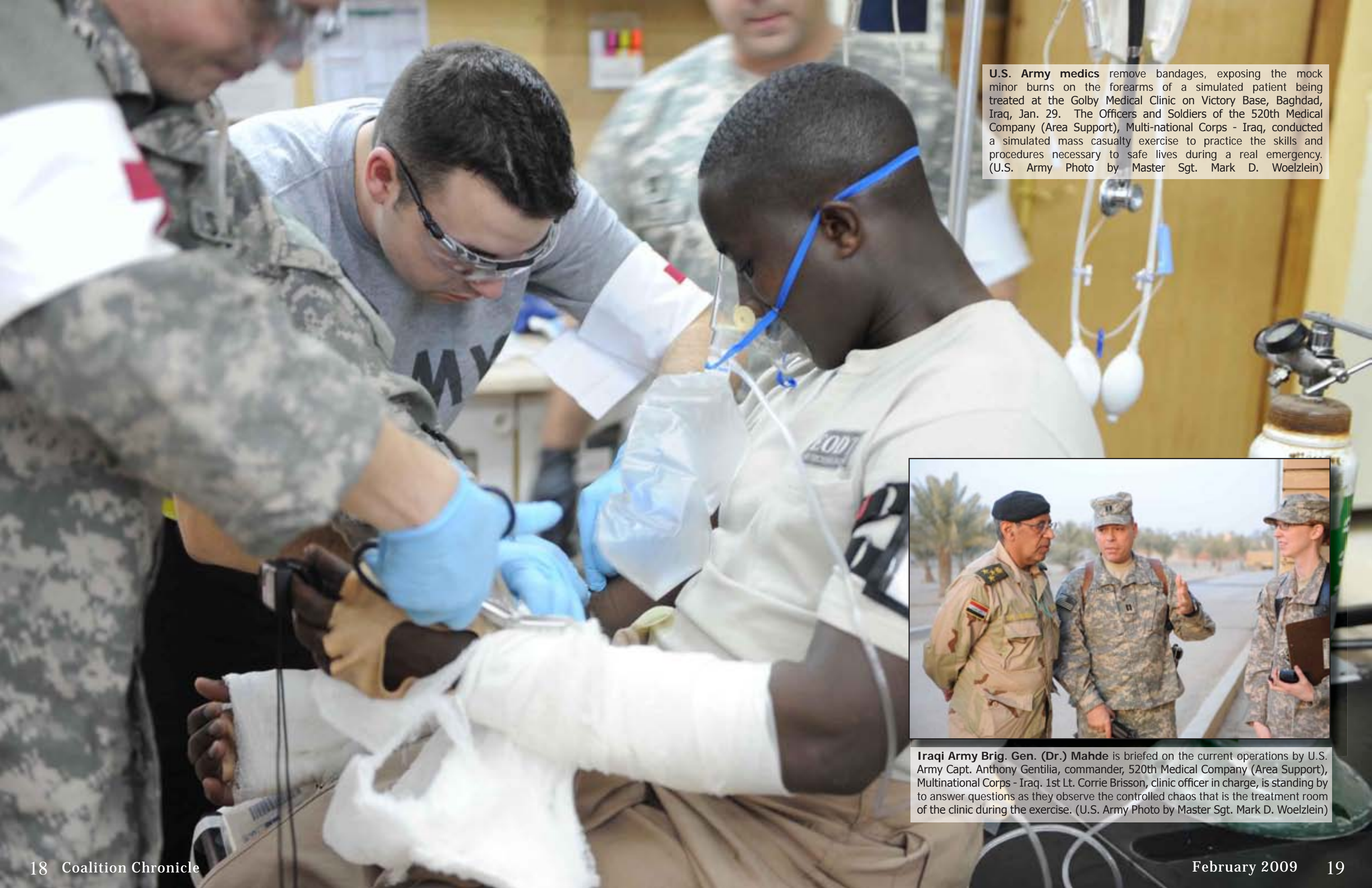
U.S. Army medics remove bandages, exposing the mock minor burns on the forearms of a simulated patient being treated at the Golby Medical Clinic on Victory Base, Baghdad, Iraq, Jan. 29. The Officers and Soldiers of the 520th Medical Company (Area Support), Multi-national Corps - Iraq, conducted a simulated mass casualty exercise to practice the skills and procedures necessary to save lives during a real emergency.