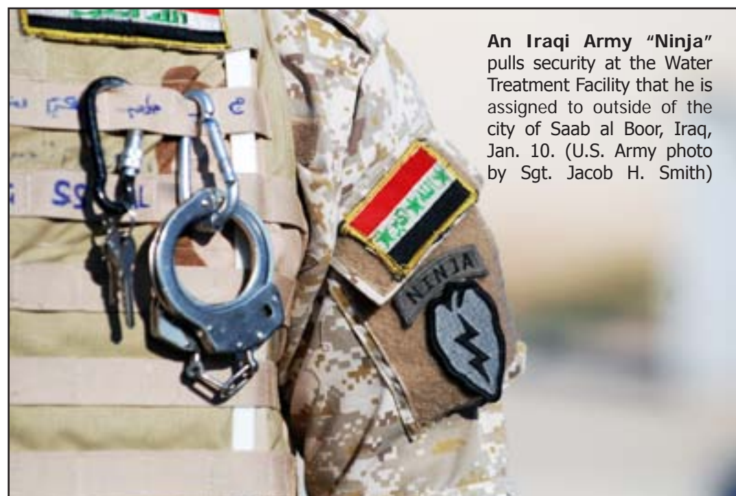
An Iraqi Army "Ninja" pulls security at the Water Treatment Facility that he is assigned to outside of the city of Saab al Boor, Iraq, Jan. 10.