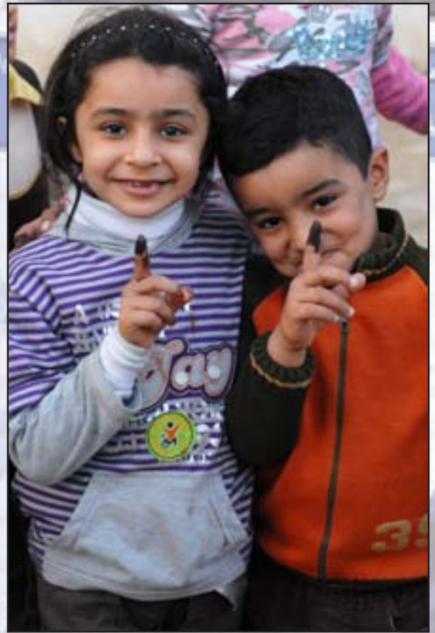
These next-generation voters proudly display their ink stained fingers during the Iraqi provincial election in Kadhimiya, Iraq, Jan. 31. In order to vote during the Iraqi provincial election, voters must be at least 18 years of age.