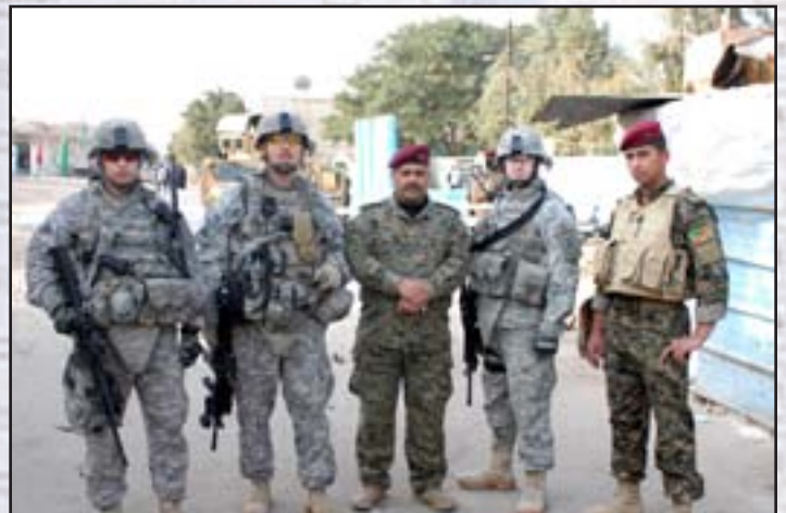
The U. S. Army 2nd Brigade, 1st Infantry Division, works along side Iraqi soldiers to increase security during the Iraqi provincial elections in Kadhimiya, Iraq, Jan. 31.