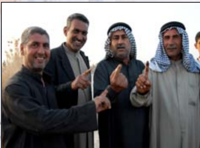
Iraqi men proudly display proof that they have voted outside a polling site in Jabella, Iraq, during the provincial elections in Babil province Jan. 31.