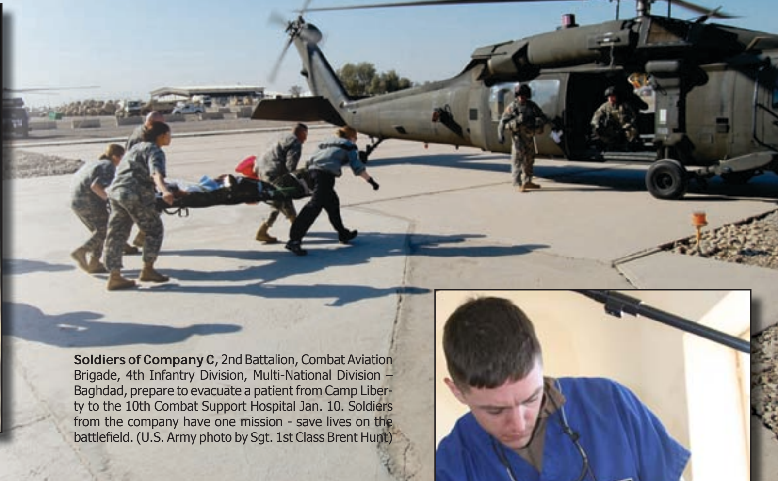
Soldiers of Company C, 2nd Battalion, Combat Aviation Brigade, 4th Infantry Division, Multi-National Division – Baghdad, prepare to evacuate a patient from Camp Liberty to the 10th Combat Support Hospital Jan. 10. Soldiers from the company have one mission - save lives on the battlefield.