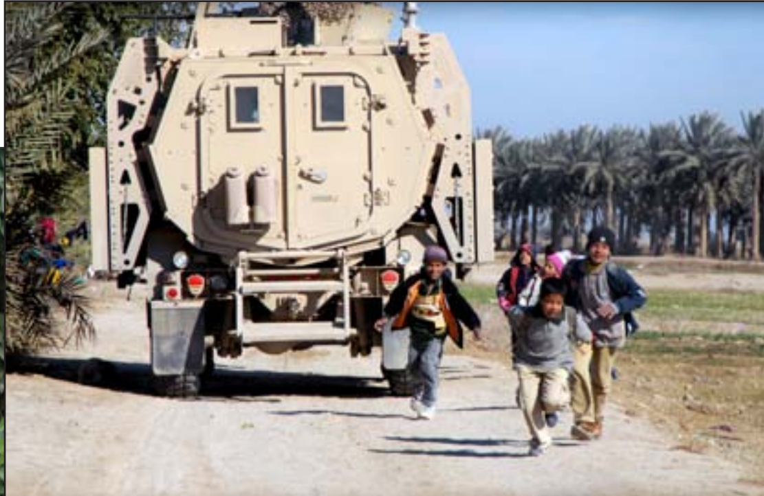
Iraqi children on their way home from school run to say hello to U.S. Soldiers in Haswah, Iraq Jan. 4.