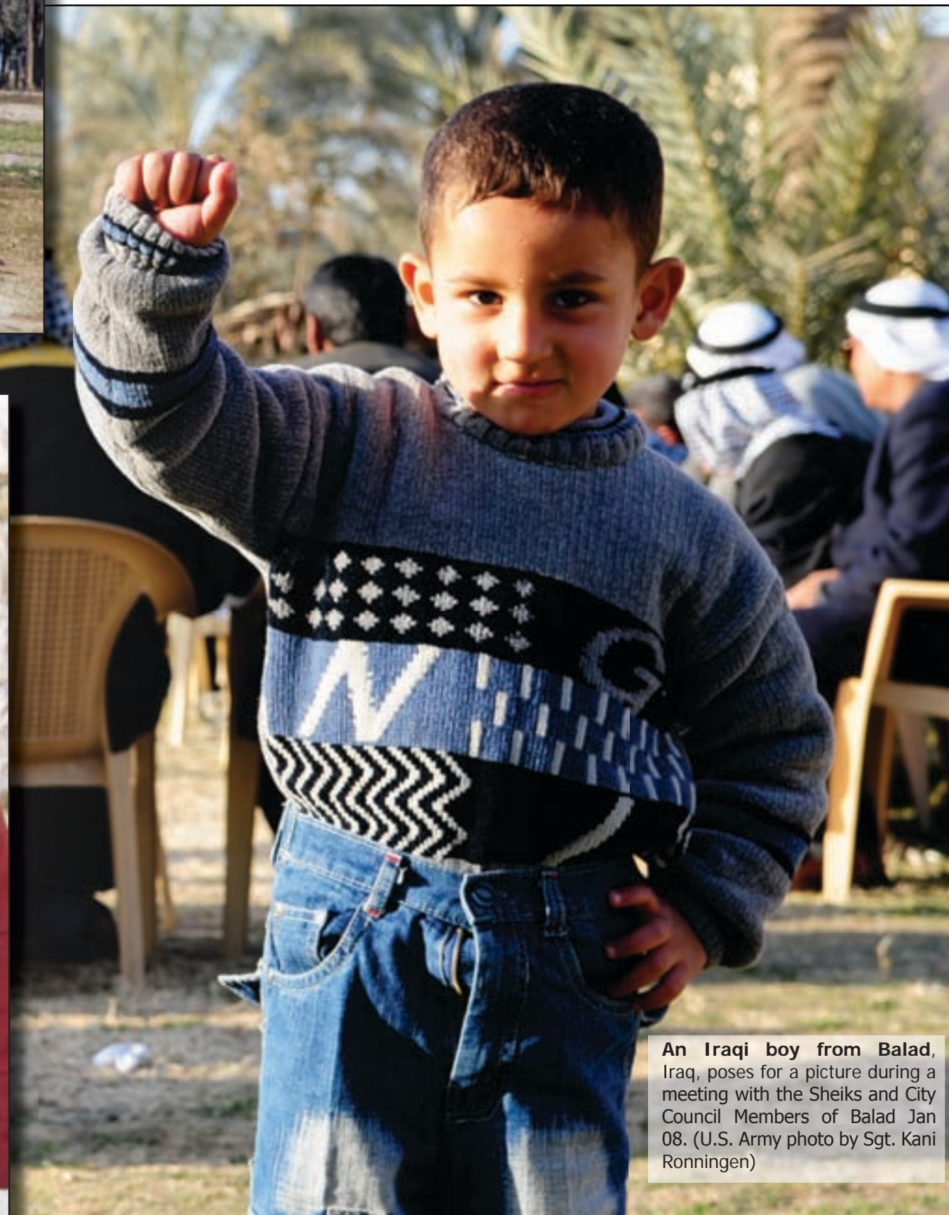
An Iraqi boy from Balad, Iraq, poses for a picture during a meeting with the Sheiks and City Council Members of Balad Jan 08.