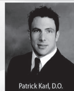
Board Certified in Pain Management