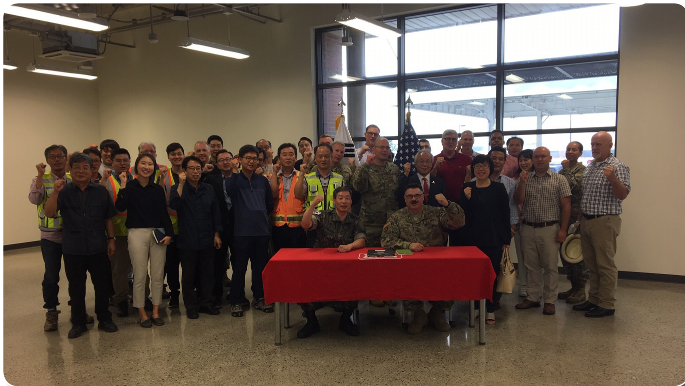
Col. Lee Woo-sik (left), Chief, Program Management Team, MURO, and Col. Garrett Cottrell (right), Deputy Commanding Officer - Transformation, United States Army Corps of Engineers Far East District, sign the acceptance release letter for the AAFES mini mall gas station and KATUSA snack bar Sept. 5.

medical asset on U.S. Army Garrison-Humphreys, medically equipped to support 65,000 eligible beneficiaries and 5,000 inpatient admissions. BDAACH’s Ambulatory Care Center can provide support for 56,300 eligible beneficiaries and 200,000 annual outpatient visits. BDAACH has expanded from its previous 38-bed set-up to 68 total inpatient beds consisting of six intensive care unit beds, 40 medical/surgical units, four operating rooms, eight labor and delivery beds and 14 behavioral health beds. A 1,000 space parking garage along with 949 surface parking spaces support the new facility. BDAACH is scheduled to be fully operational on Nov. 15.