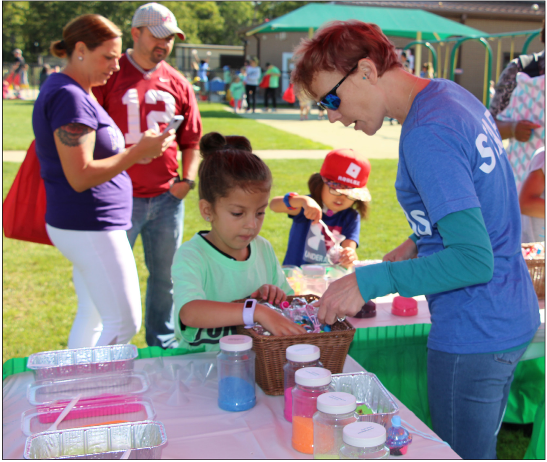
Children participate in an activity Sept. 14 at the School-Age Center/Youth Center.

Children participate in a game Sept. 14 during the 2019 Fort McCoy Day for Kids held at Rumpel Fitness Center and the School-Age Center/Youth Center. Dozens of children and parents participated in the event, which included an obstacle course, a magic show, kid's games, information booths, and more. The Directorate of Family and Morale, Welfare and Recreation organized the event.