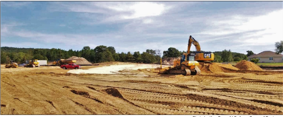
Contractors prepare the landscape for the construction of new homes Sept. 16 at the South Post Housing area at Fort McCoy.

The DPW Housing Division In 2017, Fort McCoy accepted the will be in charge of the new units