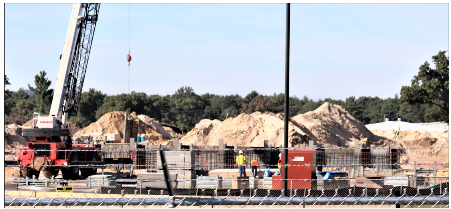
Contractors with Relyant Global LLC work on a new $7.03 million shipping and receiving facility Sept. 16 near the new Gate 20 on North Post at Fort McCov.

Projects like this align with Fort McCoy's long-range strategic planning objectives, including to "sustain and modernize Fort