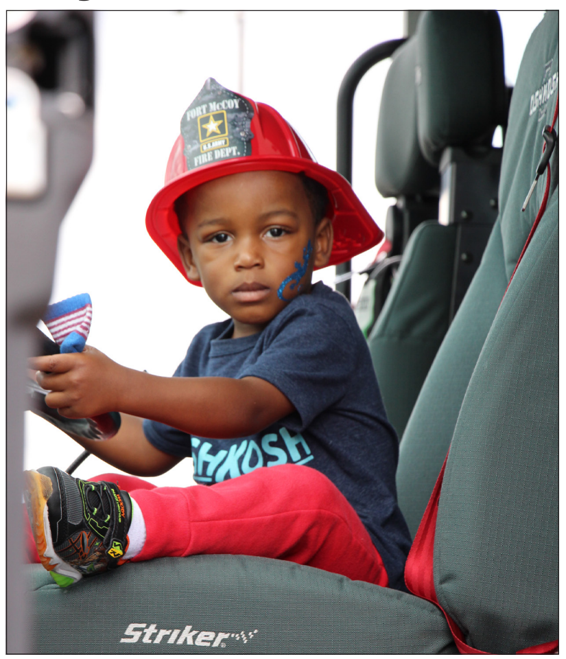
A Fort McCoy youth looks over the inside of a military vehicle on display Sept. 14 at the School-Age Center/Youth Center.