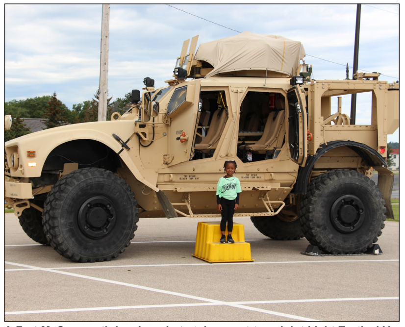
A Fort McCoy youth has her photo taken next to a Joint Light Tactical Vehicle on display Sept. 14 at the School-Age Center/Youth Center.