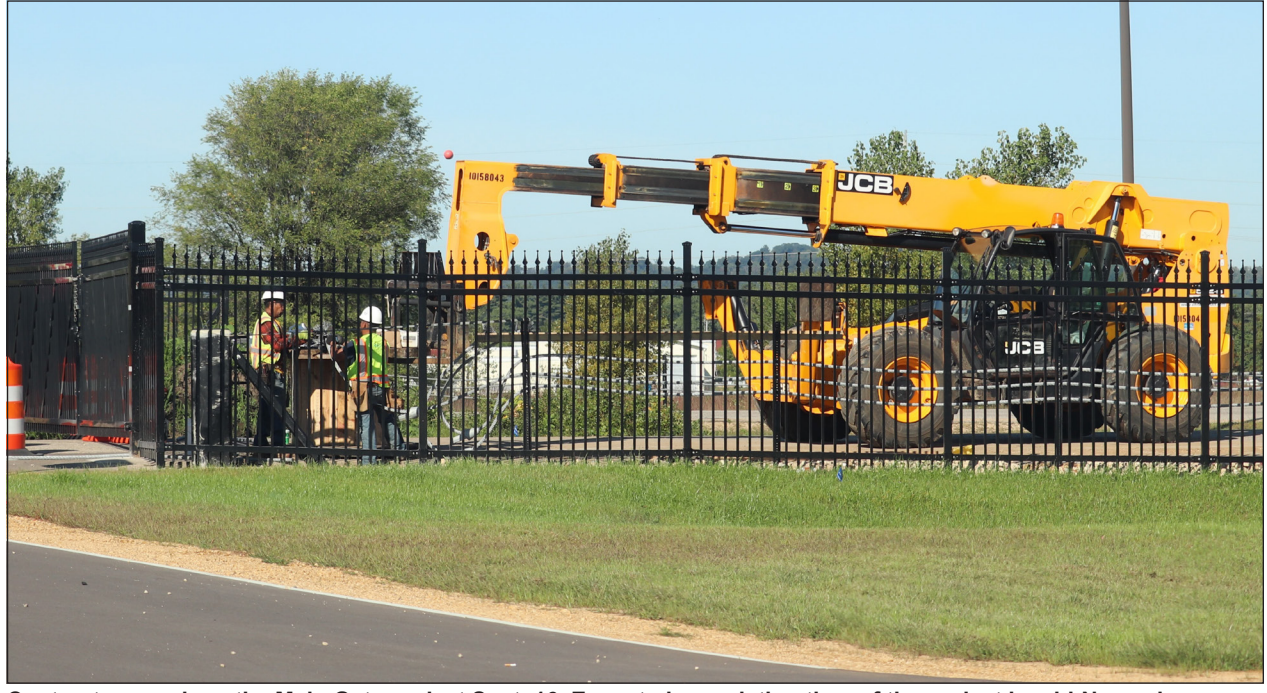
Contractors work on the Main Gate project Sept. 16. Expected completion time of the project is mid-November.

(The Army Corps of Engineers contributed to this article.)