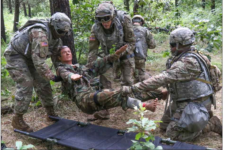
Soldiers with the 850th Transportation Company, headquartered in Lyons, Ga., place a simulated injured Soldier on a litter Aug. 14 as part of lanes testing at Fort McCoy. Lane training is a process used to evaluate unit training progress.

Soldiers had to locate an injured battle buddy in a nearby village. The lane incorporated several training tasks.