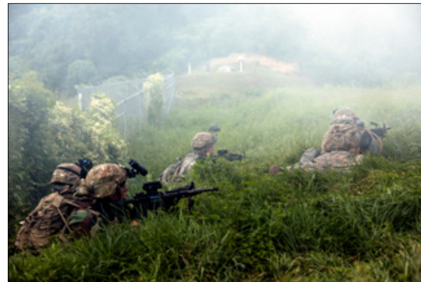
Above Soldiers with A Company, 2nd Battalion, 7th Cavalry Regiment, 3rd Armored Brigade Combat Team, 1st Cavalry Division, prepare to assault an objective during platoon situational training exercises in Korea, Aug. 28, 2019.