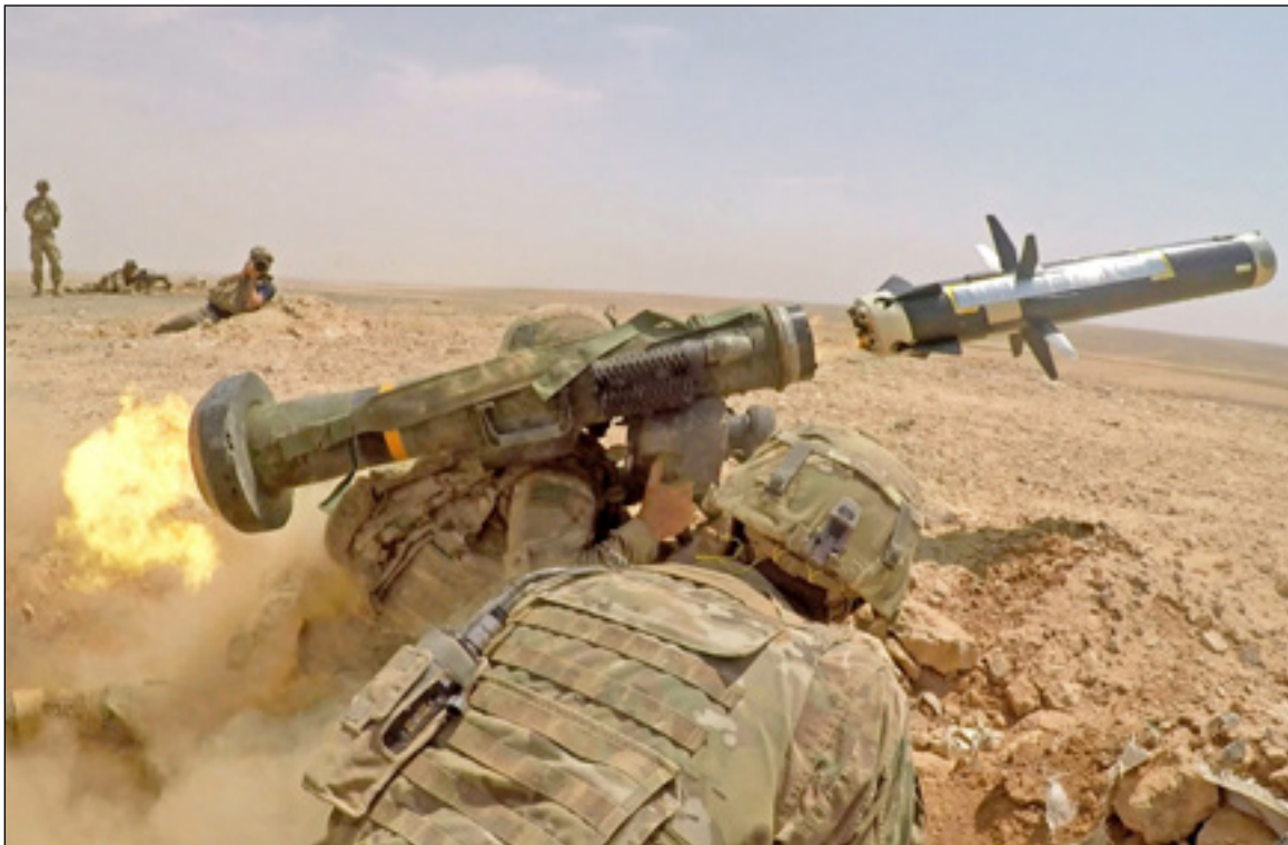
Left Soldiers with 1st Battalion, 8th Infantry Regiment, 3rd Armored Brigade Combat Team, 4th Infantry Division, fire a FGM-148 Javelin anti-tank weapon during a combined arms live fire exercise in Jordan, Aug. 27, 2019.

Here are the best photos from FORSCOM Public Affairs professionals world-wide. For more photos and information, click these photos or visit army.mil/forscom