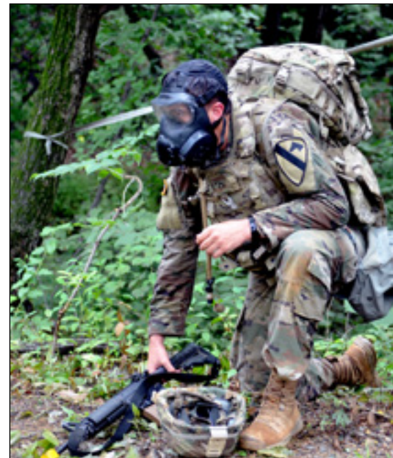
Right A Soldier with 6th Squadron, 9th Cavalry Regiment, 3rd Brigade Combat Team, 1st Cavalry Division, dons his protective mask as part of the Saber First Responder Course testing on Camp Hovey, Korea, Aug. 16, 2019.