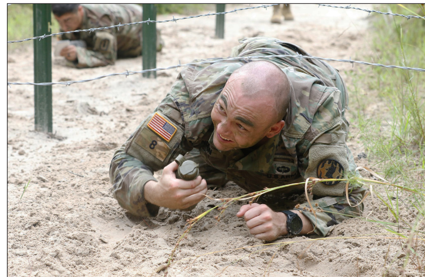
Above A Soldier from the 89th Military Police Brigade, low crawls during the FORSCOM Best Warrior Competition on Fort Bragg, N.C., Aug. 20, 2019.