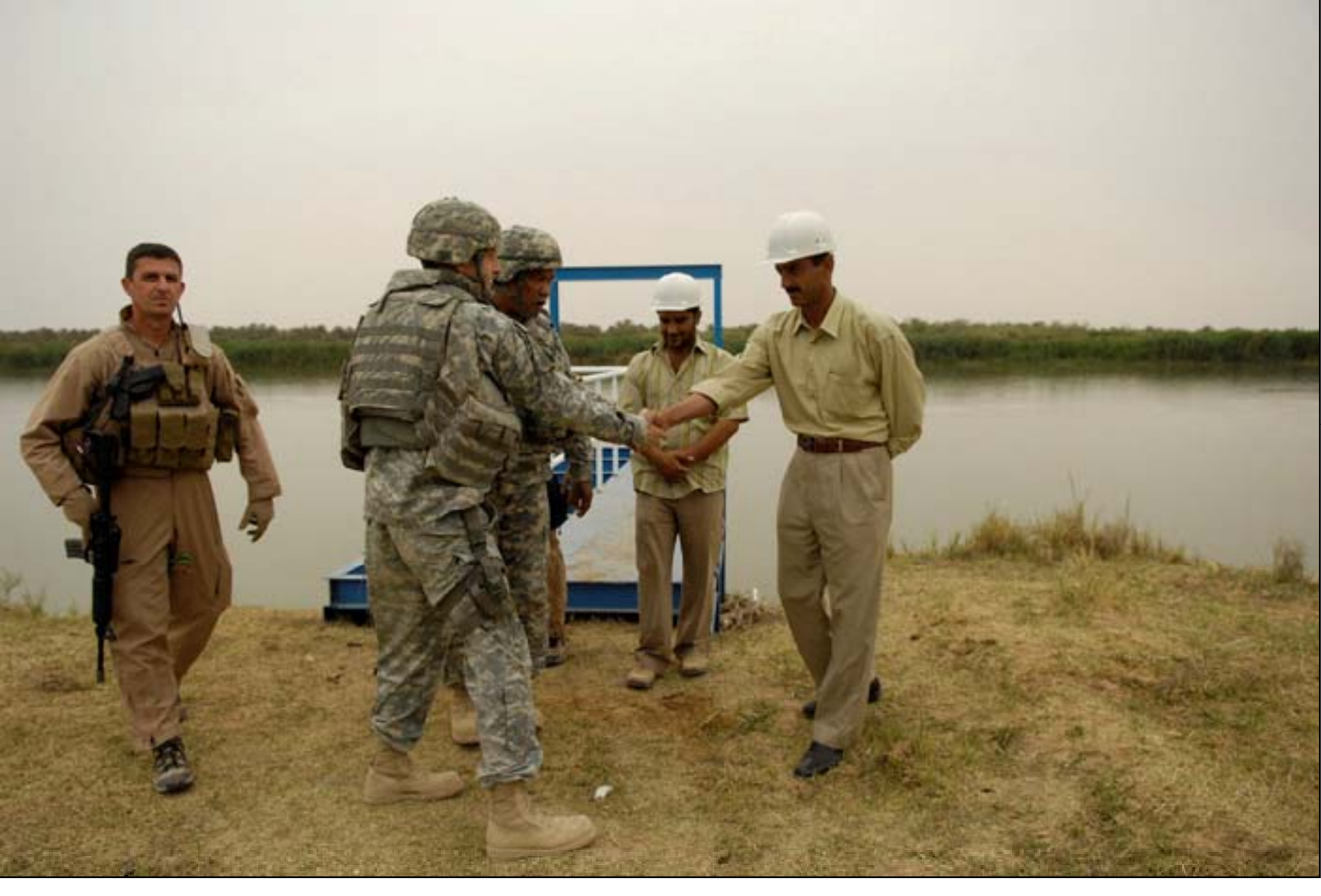
Members from the U.S. Army Corps of Engineers shake hands with the lead construction worker at the water compact unit in Al Abu Shemsi, Iraq, on May 09, 2009. Once complete the unit and network will provide more than 1,000 citizens with potable water.