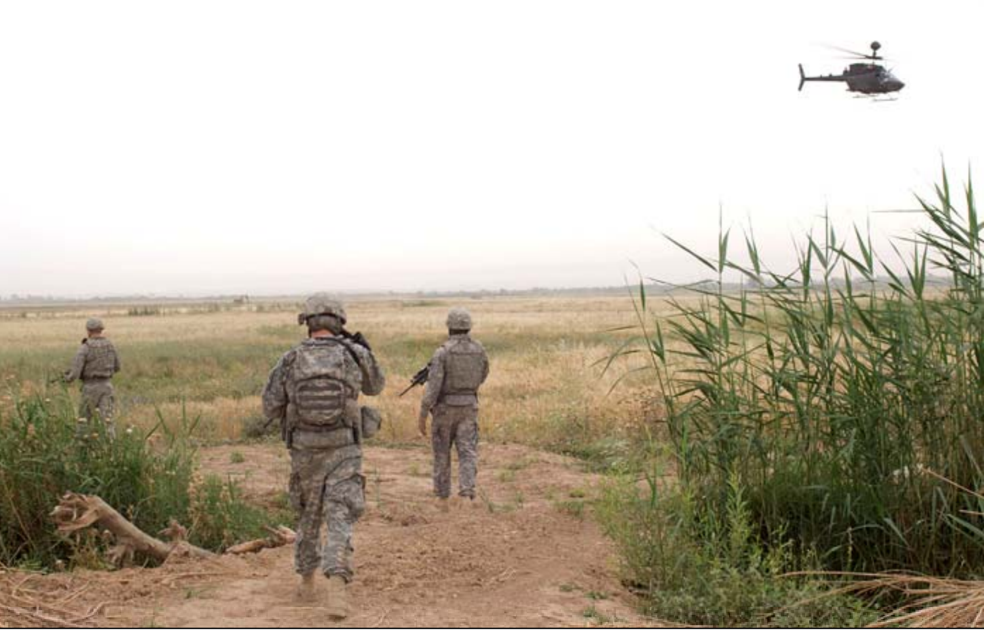
U.S. Soldiers from 5th Battalion, 1st Cavalry Regiment, 1st Stryker Brigade Combat Team, 25th Infantry Division, clear the outskirts of the village of Kala Hussein, Iraq, on May 10, 2009.