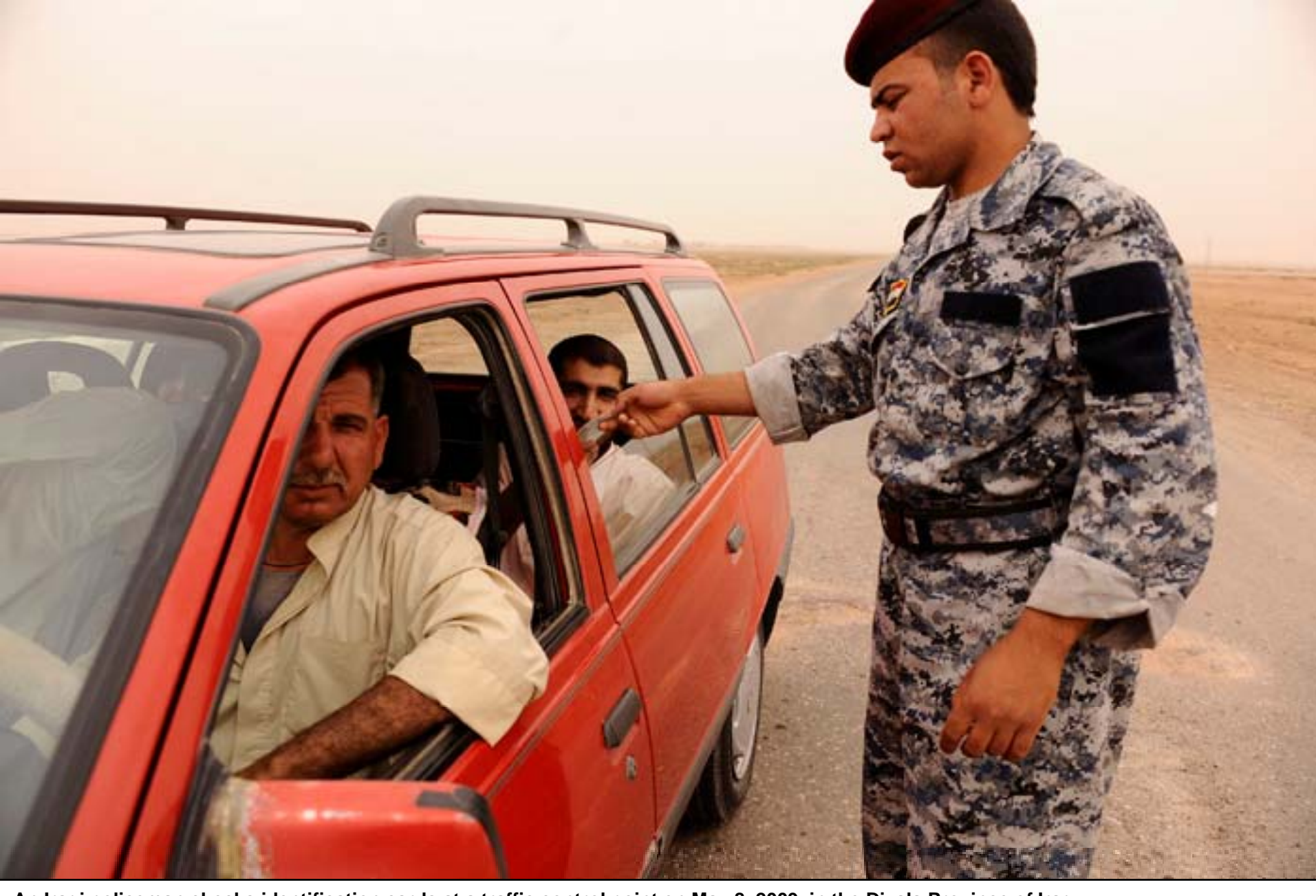
An Iraqi policeman checks identification cards at a traffic control point on May 8, 2009, in the Diyala Province of Iraq.