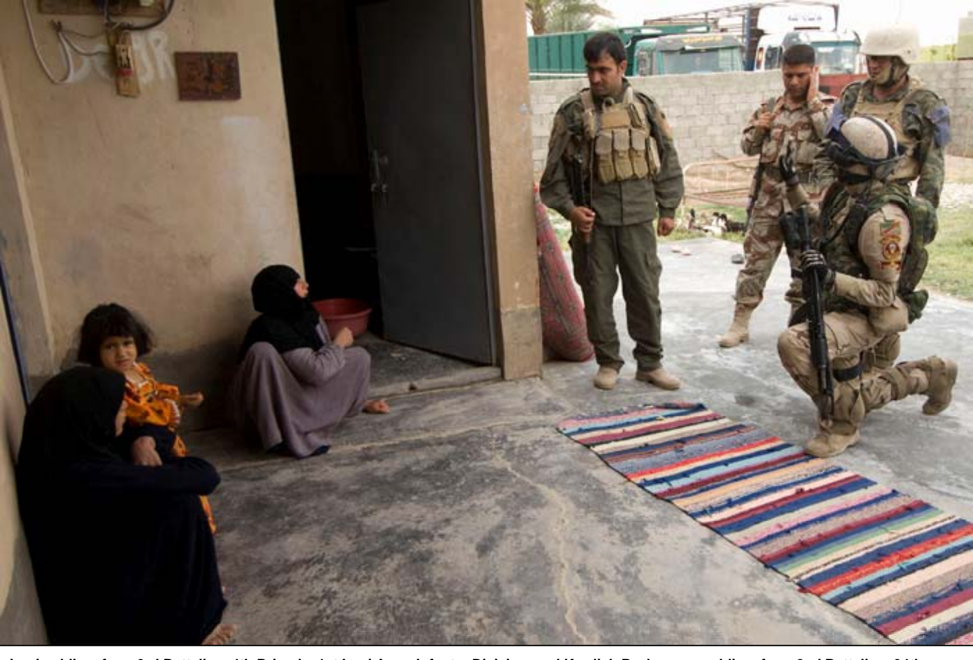
Iraqi soldiers from 3rd Battalion, 4th Brigade, 1st Iraqi Army Infantry Division, and Kurdish Peshmurga soldiers from 2nd Battalion, 34th Brigade, speak with a family during a clearing operation in the village of Kala Hussein, Iraq, on May 10, 2009.