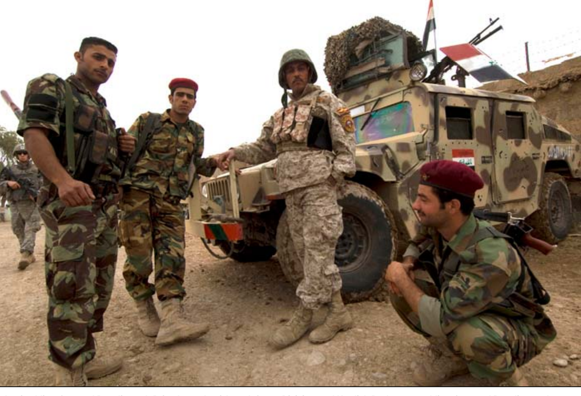
Iraqi soldiers from 3rd Battalion, 4th Brigade, 1st Iraqi Army Infantry Division, and Kurdish Peshmurga soldiers from 2nd Battalion, 34th Brigade, take a break during a clearing operation in the village of Kala Hussein, Iraq, on May 10, 2009.