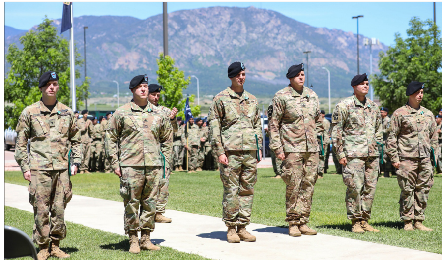
Soldiers with the 1st Battalion, 12th Infantry Regiment, 2nd Infantry Brigade Combat Team, 4th Infantry Division, received awards in front of their peers and leaders during a ceremony at Fort Carson, Colo., June 11, 2019.