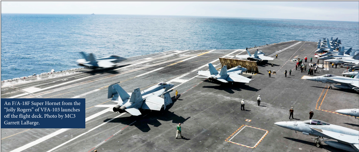
An F/A-18F Super Hornet from the "Jolly Rogers" of VFA-103 launches off the flight deck.