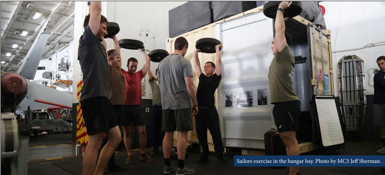
Sailors exercise in the hangar bay.