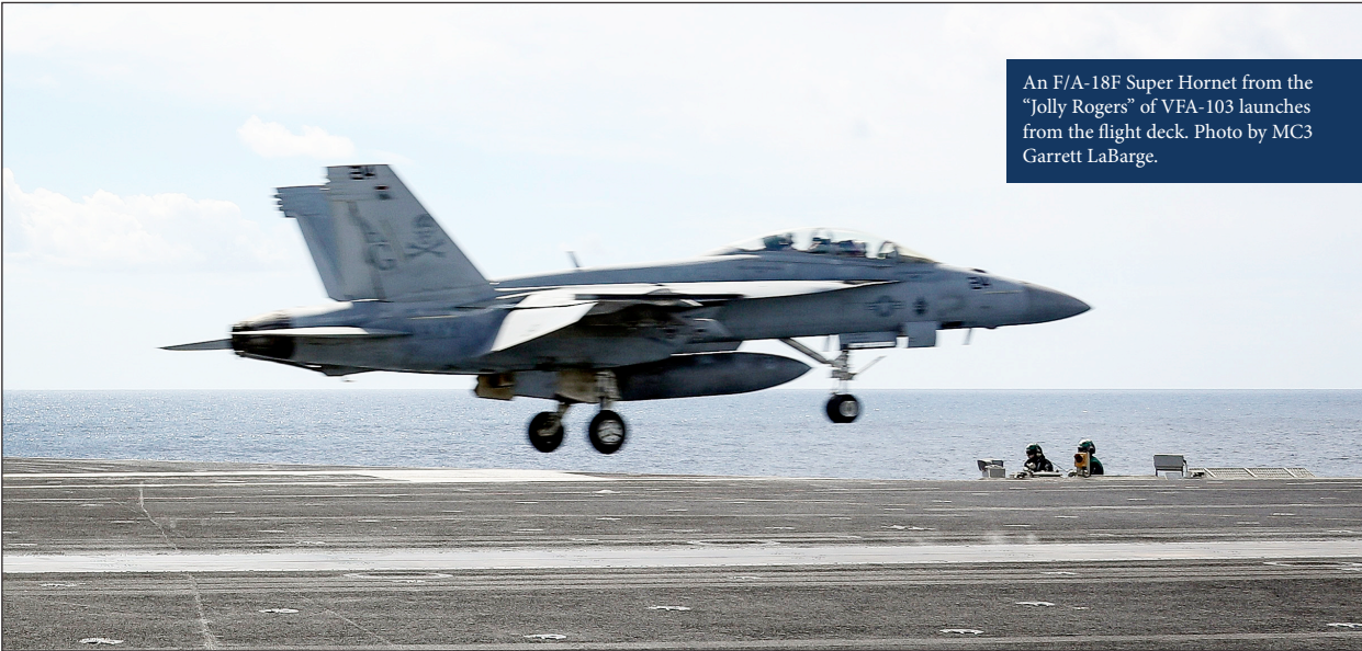
An F/A-18F Super Hornet from the "Jolly Rogers" of VFA-103 launches from the flight deck.