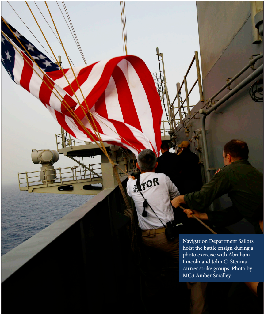
Navigation Department Sailors hoist the battle ensign during a photo exercise with Abraham Lincoln and John C. Stennis carrier strike groups.