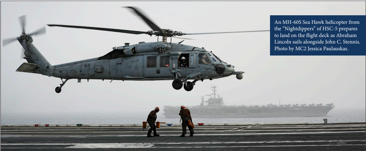
An MH-60S Sea Hawk helicopter from the "Nightdippers" of HSC-5 prepares to land on the flight deck as Abraham Lincoln sails alongside John C. Stennis.