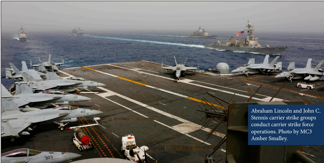
Abraham Lincoln and John C. Stennis carrier strike groups conduct carrier strike force operations.