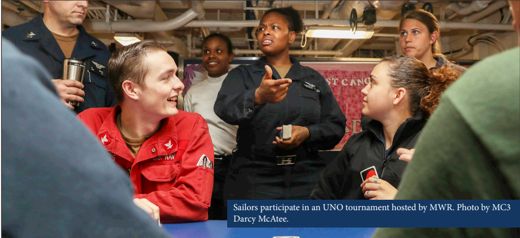
Sailors participate in an UNO tournament hosted by MWR.