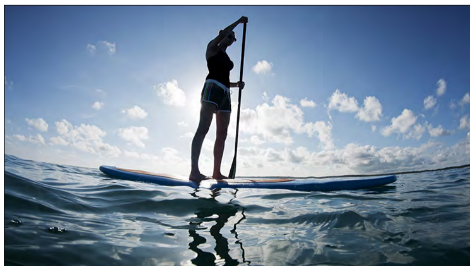
Learn how to stand up paddleboard this summer with Outdoor Recreation! Find out more at www.wainwright.armymwr.com