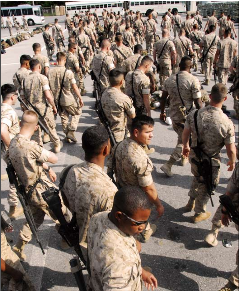
9th Engineer Support Battalion Marines with 3rd Marine Logistics Group prepare to board buses on Kadena Air Base March 26 following their return from a seven-month deployment to Iraq. Their mission was focused on rebuilding Iraqi infrastructure. The unit's return marks the withdrawal of the last Marine Corps Engineer Support Battalion in Iraq.