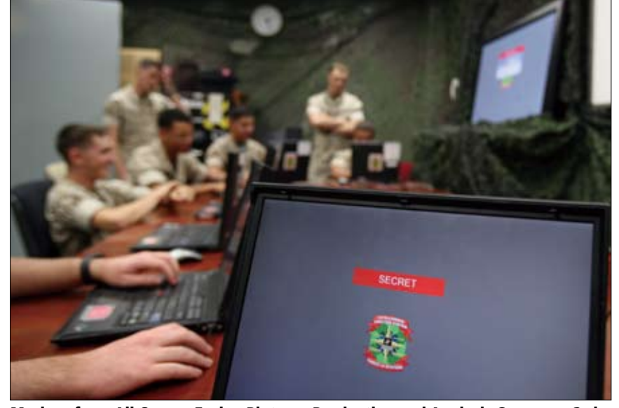
Marines from All-Source Fusion Platoon, Production and Analysis Company, 3rd Intelligence Battalion, 3rd Marine Expeditionary Force, conduct research in the Center for Afghanistan Core Knowledge Room.

Imagery, human intelligence, counter-intelligence