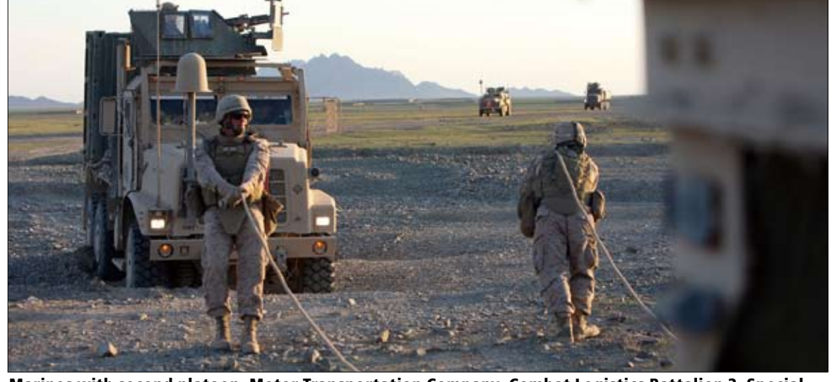
Marines with second platoon, Motor Transportation Company, Combat Logistics Battalion 3, Special Purpose Marine Air Ground Task Force-Afghanistan, pull tow cables to a stuck seven-ton truck during a combat patrol en route to Forward Operating Base Now Zad, Helmand Province, Afghanistan, March 6.