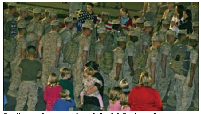
Family members eagerly wait for 9th Engineer Support Battalion, 3rd Marine Logistics Group, Marines and sailors to be dismissed on Camp Hansen March 26.

The bottom line is there is no fail-safe way to guard from browser vulnerabilities. Safe browsing habits along with current security patches and updated virus definitions are often the best line of defense for preventing personal information from being exploited.