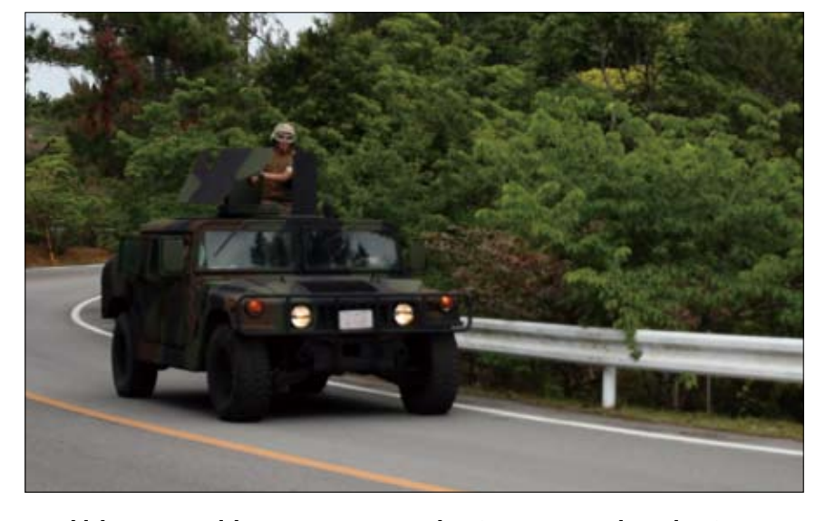
A vehicle gunner with Motor Transportation Company, Marine Wing Support Squadron 172, Marine Wing Support Group 17, 1st Marine Aircraft Wing, keeps a watchful eye out for simulated improvised explosive devices March 26 on Camp Hansen.

The course began with an in-depth presentation where instructors explained and displayed to Marines what IEDs look like and different ways the enemy hides them.