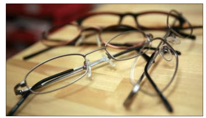
A new Ophthalmic Services Unit opened March 23 at the Naval Hospital at Camp Lester. The addition allows single vision glasses to be made here on Okinawa instead of having them shipped from the United States or South Korea.