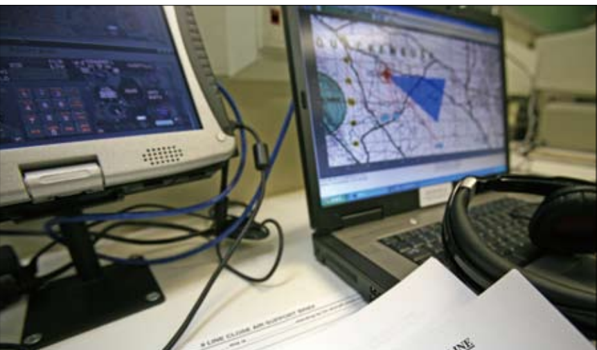
Within the Combined Arms Network, Marines can use different tools such as compasses, binoculars, night vision scopes and computers to assist them in learning to "call for fire." The procedure is a standard communication method between a service member on the ground requesting an attack on a specific target and artillery personnel or pilots.

Adding the fact there are limited ranges in the Asia Pacific region and throughout the world where full-scale fire support exercises are available makes the