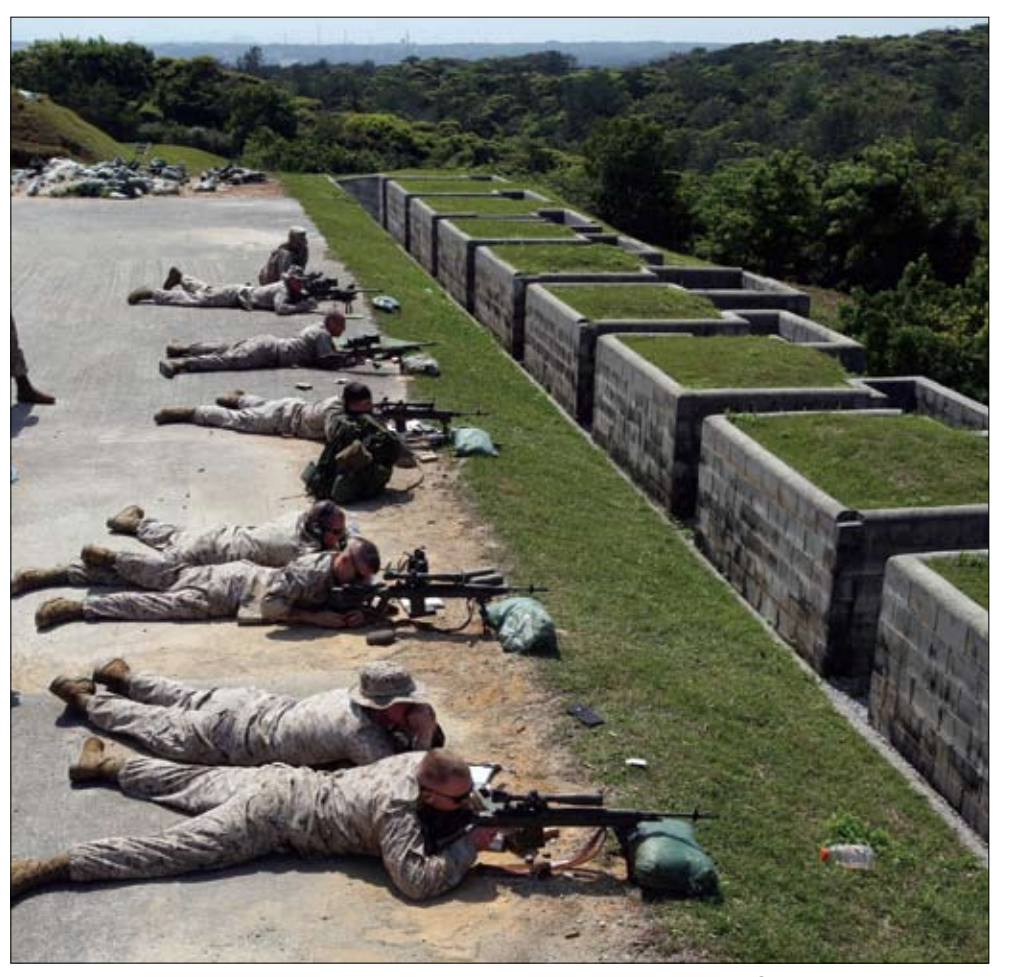
Special Reaction Team marksman Marines sight-in with the help of observers during marksmanship drills at Camp Schwab's Range 10, March 12.