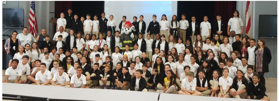
Students and teachers from Fort Buchanan’s Antilles Middle School pose with Sparky during Fire Prevention Week.

That same day, FB firefighters also went to garrison headquarters where Sparky met with everyone and distributed fire prevention materials.