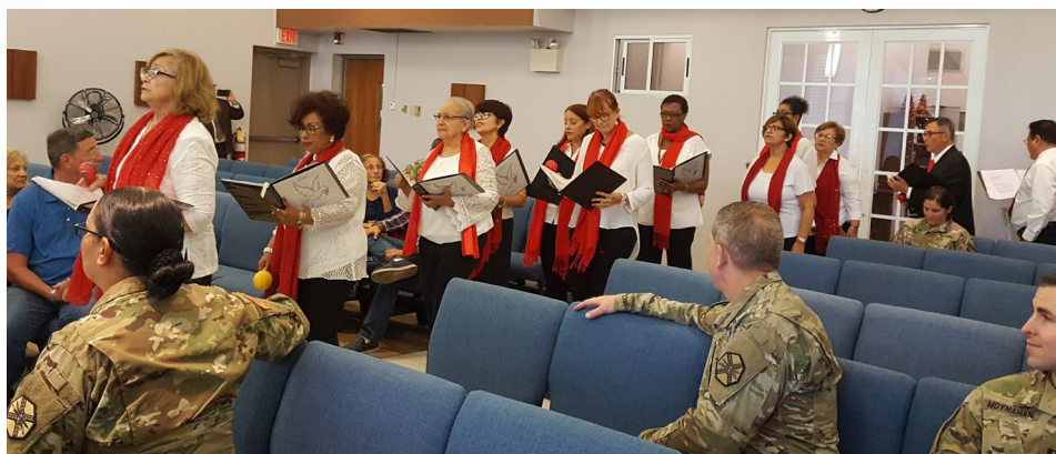
The Cupey First Baptist Church Choir sang a melody of traditional American Christmas songs and Puerto Rican "aguinaldos" (typical Christmas carols) both in Spanish and English, to the enjoyment of Soldiers, staff and families.

As we enter the upcoming holiday season, I believe that it is beneficial to follow this bit of wisdom offered by Paul. May we keep our hearts and minds focused on our important relationships, the blessings we have in our lives, and our ability to be a blessing to another in need. Lastly, may the peace of the Almighty One be upon you and your Family in the days ahead.