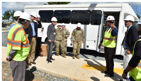
VIP guests received a tour and information on the construction of the new Child Development Center project.

construction, passing through housing, and the sites for the new Apparatus Building, new Access Control Point project, Army Reserve centers, the Rodríguez Army Health Clinic, and the Golf Course. The windshield tour ended at Fort Buchanan’s Community Club with a luncheon where they were joined by the Mayor of Guaynabo, the Hon. Angel Pérez Otero.