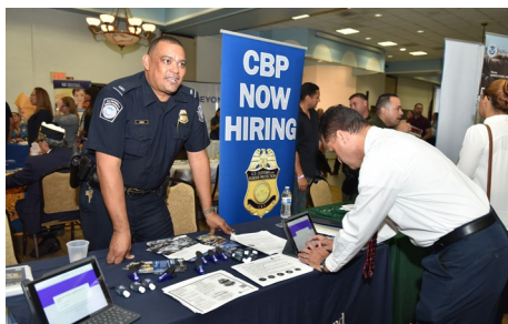
Customs and Border Patrol assisted applicants in submitting their applications at their informational table.

“If you look around you will see the commitment of a multitude of agencies and companies that joined us in this