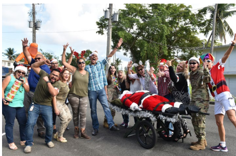
Staff of the Rodríguez Army Health Clinic gathered by their entry into “Operation Christmas” parade, a “bedridden Santa.”