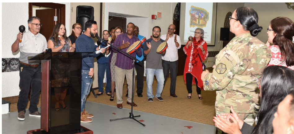
This 1st Quarter Town Hall ended with holiday cheer with musical entertainment by a traditional "parranda" made up of garrison staff singing typical Puerto Rican Christmas songs.