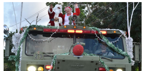
The appearance of Mr. and Mrs. Santa Claus marked the end of "Operation Christmas" parade.