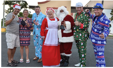
Garrison Command staff all dressed up in colorful Christmas theme outfits pose with Mr. and Mrs. Santa Claus.