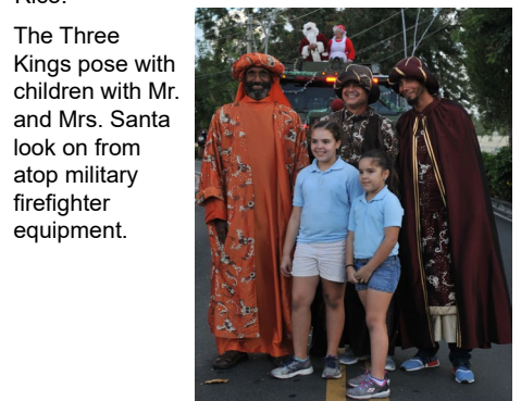
The Three Kings pose with children with Mr. and Mrs. Santa look on from atop military firefighter equipment.