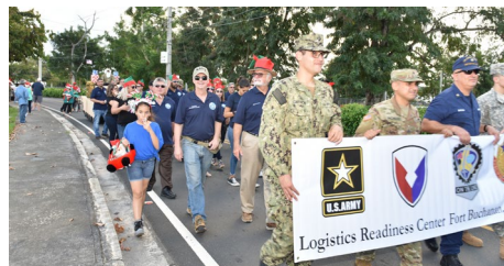
All the Logistics Readiness Center personnel paraded with Soldiers, Coast Guardsmen and their families.