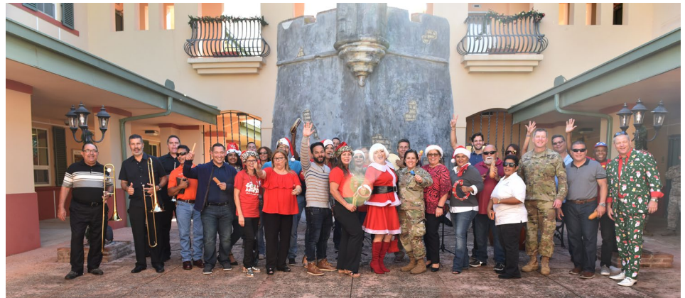
Fort Buchanan’s traditional “parranda” with over 30 members brought music and joy to the RAHC, 1st MSC headquarters, PRNG headquarters and the Exchange main lobby.

The “parranda” ended at the Exchange main lobby area where Veterans became part of the “parranda” singing and playing instruments.