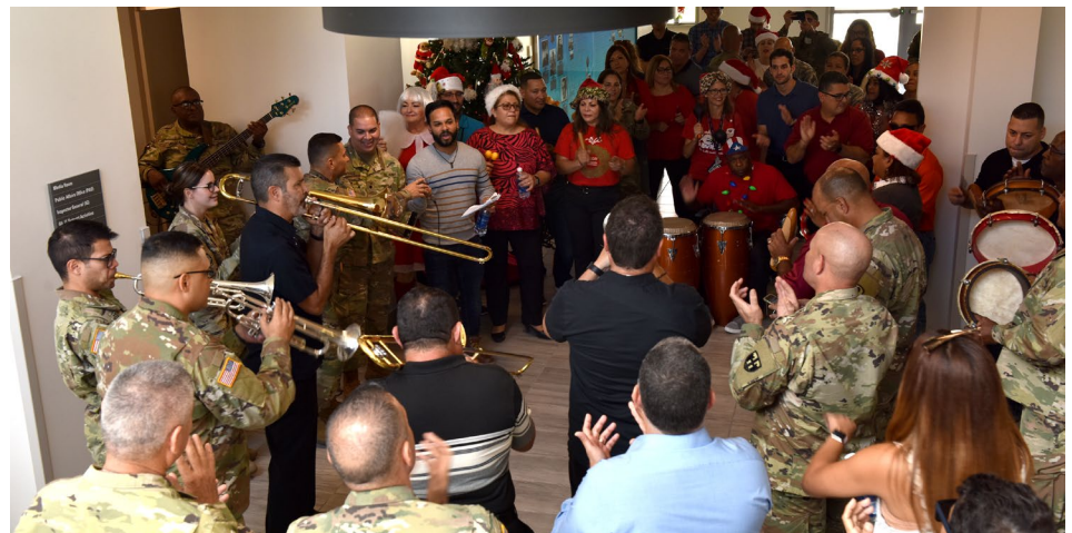
Garrison staff and PRNG Soldiers joined forces to bring to all, holiday cheer.