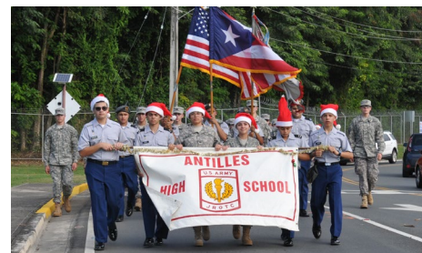
Well over 80 cadets sang cadences as they marched in representation of the Antilles High School JROTC.