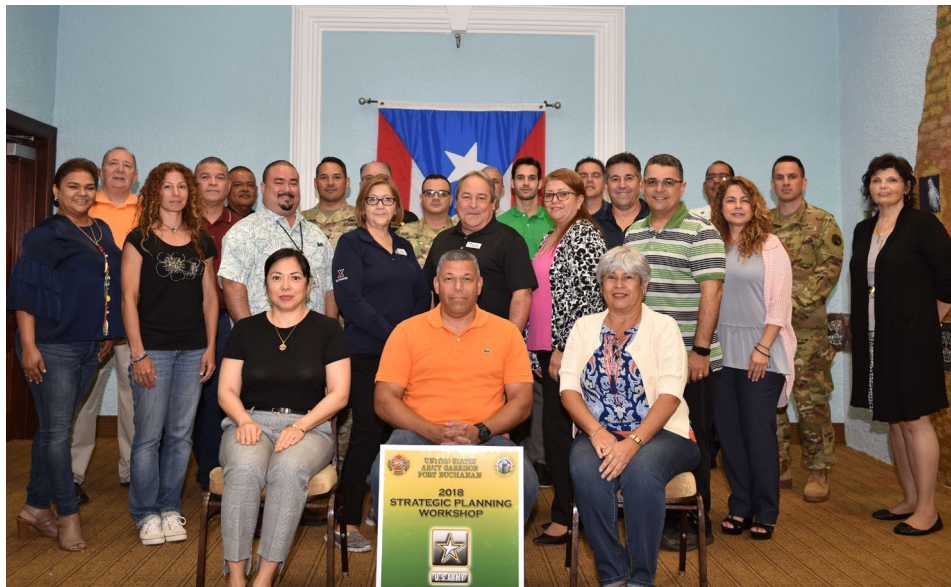
The stakeholders from Fort Buchanan, garrison directorates, tenant commands and workforce who participated in the workshop.