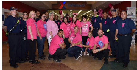
Fort Buchanan Firefighters and AAFES staff pose for a group shot during the joint Cancer Awareness event.