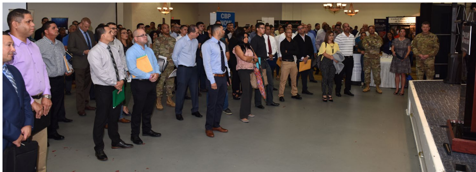
Approximately 600 persons attended the hiring fair held at Fort Buchanan’s Community Club and Conference Center.

Attendees received orientation, filled out applications, established network connections for career advancement