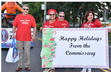
Fort Buchanan's Commissary paraded and handed out lots of candy to the children watching the parade with their parents.