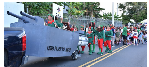
Children from DFMWR's Child Youth Center marched alongside their float, the USS Puerto Rico.