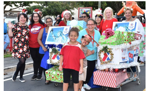
Army Air Force Exchange Services paraded with carts full of presents and toys from the Exchange.