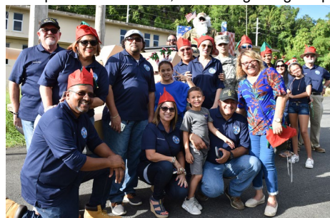
The Logistics Readiness Center pose in front of their entry to the parade, an M1 Abrams tank with Santa at the turret.