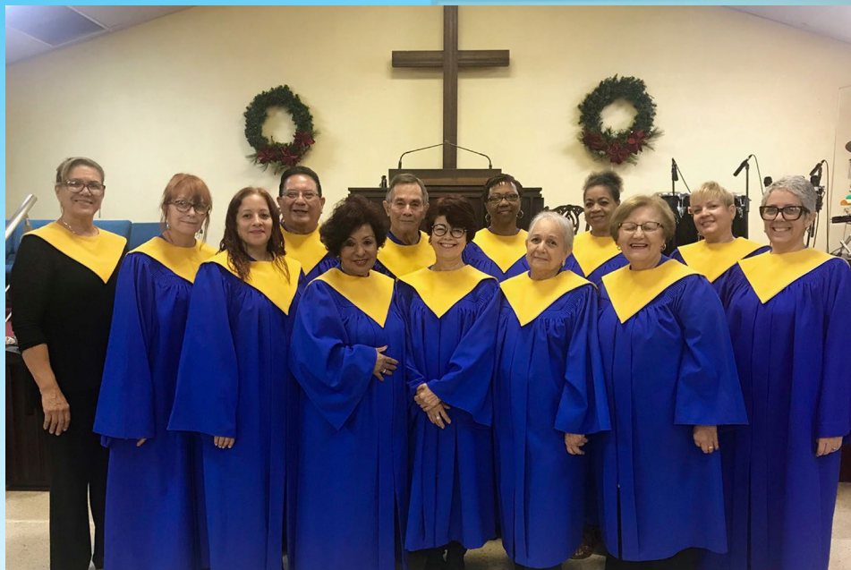
Fort Buchanan's Religious Support Office held a Christmas Concert for the installation's community at the post chapel December 13, 2018, with the Cupey First Baptist Church Choir, .

"Finally, beloved, whatever is true, whatever is honorable, whatever is just, whatever is pure, whatever is pleasing, whatever is commendable, if there is any excellence and if there is