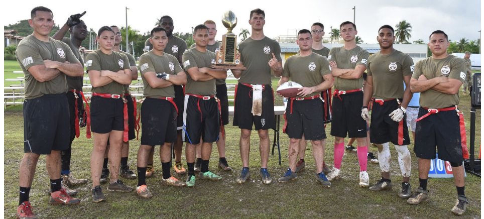
After winning against the Army, US Marine Corps members of Detachment 1, Landing Support Company, CLR - 45 stationed at Fort Buchanan proudly pose with their well earned USAG Turkey Bowl Trophy.