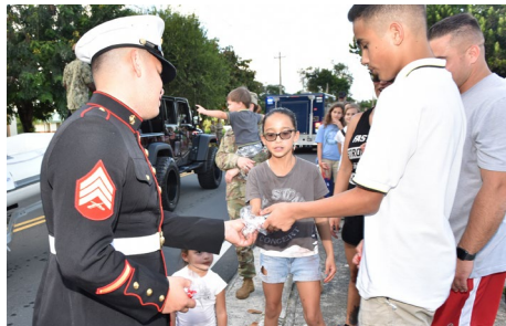
Marines from the US Marine Corps Det. 1, LS Co. CLR-45 at Fort Buchanan handed out candy to the children along the parade route.