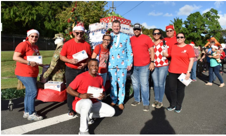
Members of the Directorate of Human Resources pose in front of their Mass Mailing Float.