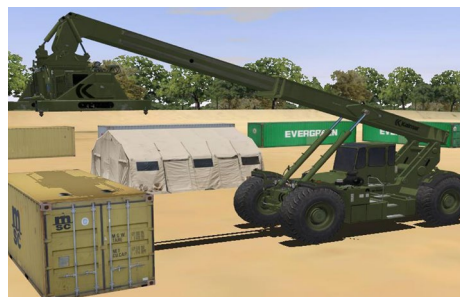
The actual RTCH requires wide maneuverable space in order to lift containers, using the simulator eliminates these constraints.

This is the first time Fort Buchanan has the capability to conduct ATLAS and RTCH realistic training in a controlled environment. The training benefits are many; a safe, real learning environment; immediate application of classroom knowledge, faster acquisition of skills, reduced equipment