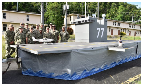
The Navy personnel pose behind aircraft carrier No. 77, their creative submission for the Christmas parade.