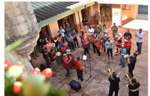
1st MSC staff with garrison musicians gathered in front of their “Garrita” in the atrium of their headquarters.