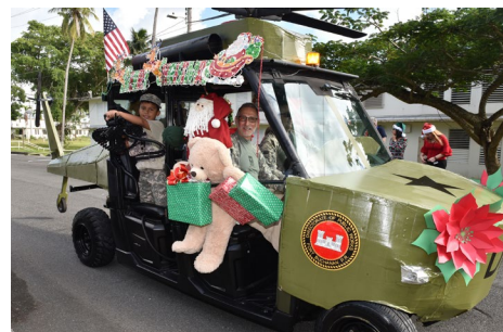
The Directorate of Public Works prepared a festive helicopter with a young gunner on point.