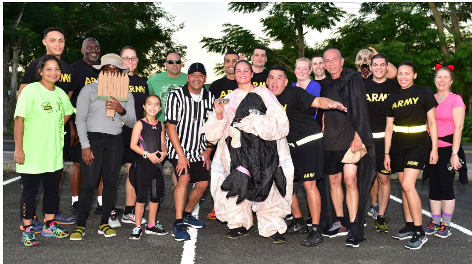
The participants of the 1st Costume / Halloween theme fun run/walk pose for a group shot.

Halloween costumes added a unique twist to regular run/walks. Soldiers from the US Army Garrison Installation Legal Office (ILO) and