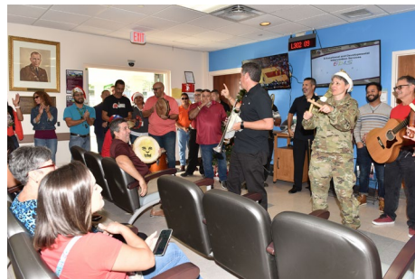
Staff and patrons of the RAHC joined in the singing of “aguinaldos” during the “parranda.”