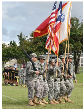
The Color Guard from Antilles High School JROTC provided the official part of the Army vs. Marines game of flag football.