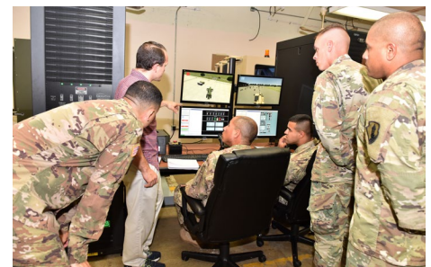
Soldiers from the 266th Ordnance Co., 346th Transportation Co. Bn. and 393rd CSSB received training at the Instructor Station by a ATLAS and RTCH instructor.

Several Soldiers from three 1st MSC units, received the Train-the-Trainer training from ATLAS and RTCH trainers at the Instructor Station under the watchful eyes of the TSC staff.