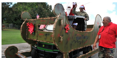
The Installation Legal Office and Directorate of Plans, Training, Mobilization and Security joined forces participating with this military Santa's sleigh.