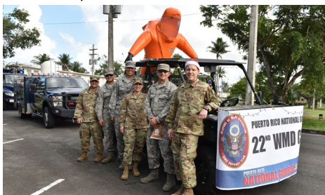
The 22nd Weapons of Mass Destruction CST of the P.R. National Guard had three vehicles and a giant dressed in chemical protective gear.