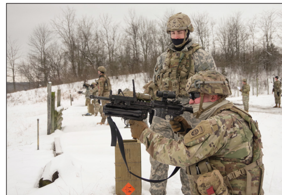
Above A paratrooper assigned to the 1st Battalion, 508th Parachute Infantry Regiment, 3rd Brigade Combat Team, 82nd Airborne Division, fires an M320 Grenade Launcher, Jan. 16, 2019, at Camp Atterbury, Ind.