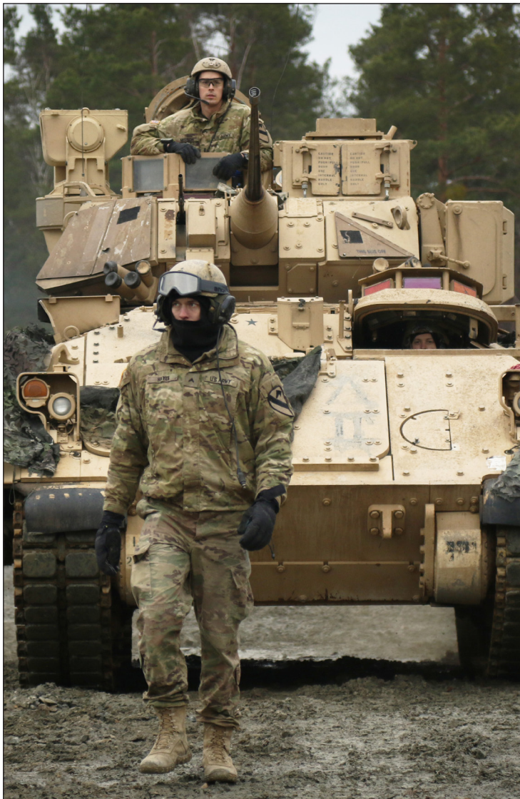
Above A Soldier from 2nd Battalion, 5th Cavalry Regiment, 1st Armored Brigade Combat Team, 1st Cavalry Division, ground guides a Bradley Fighting Vehicle during Combined Resolve XI at the Grafenwoehr Training Range in Germany, Jan. 17, 2019.

Here are the best photos from FORSCOM Public Affairs professionals world-wide. For more photos and information, click these photos or visit army.mil/forscom