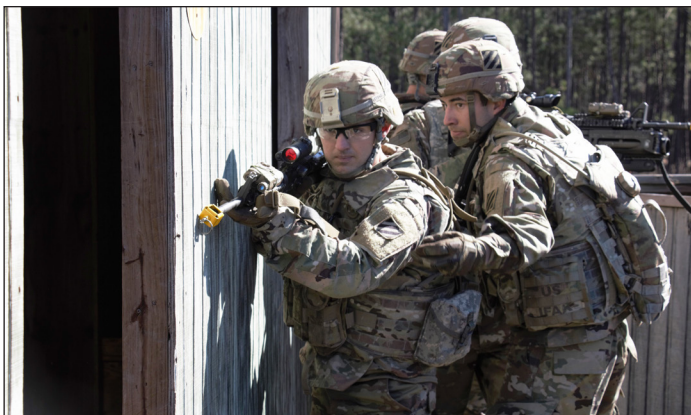
Below Infantrymen assigned to 2nd Armored Brigade Combat Team, 3rd Infantry Division, prepare to enter a building during a squad training exercise at Fort Stewart, Ga., Jan. 16, 2019.