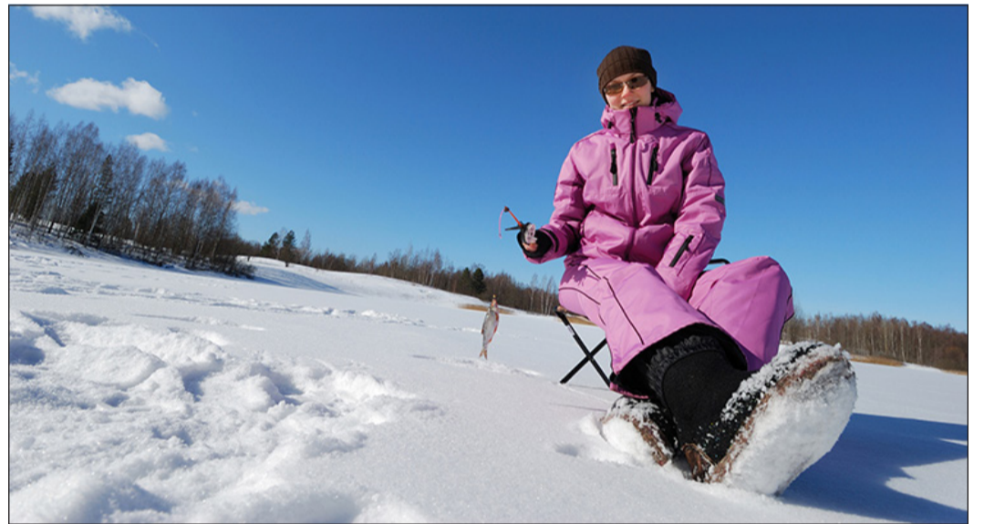
Join the Outdoor Recreation team for a little ice fishing action at Birch Lake! Find out more at www.wainwright.armymwr.com