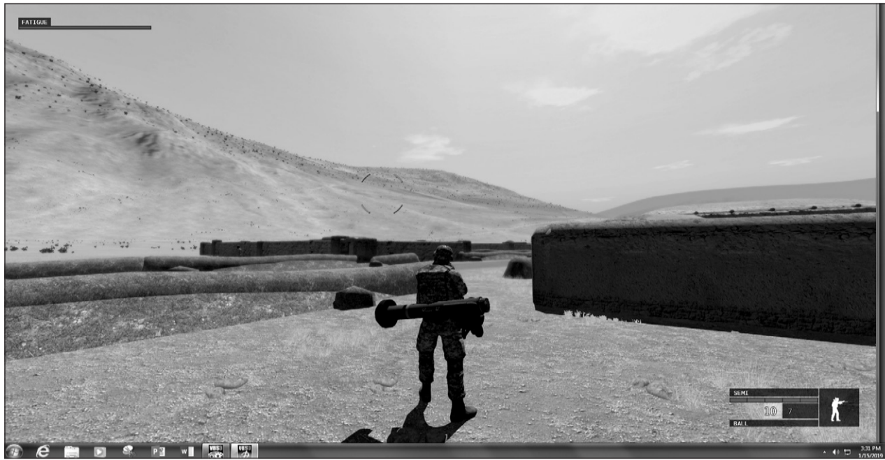
A virtual Soldier surveys the territory of Bomol, Afghanistan, during a virtual staff ride held Jan. 14, at the Digital Training Facility.

The briefing was attended by doctrine analysts, training and curriculum developers and leaders from the Basic Officer Leader Course, Captains Career Course, Engineer Warrant Officer Basic Course, Engineer Warrant Officer Advanced Course, Engineer Prime Power School and current students of the Reserve Engineer Senior Leader Course.