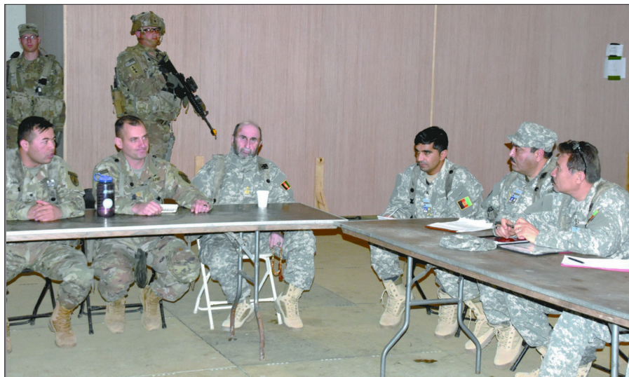
A Guardian Angel from the 2nd Battalion, 127th Infantry Brigade, Wisconsin National Guard, stands watch over a meeting between Afghan National Army members and advisors with the 2nd Security Force Assistance Brigade during an engagement exercise, Jan. 16, 2019, at the Joint Readiness Training Center, Fort Polk, La.