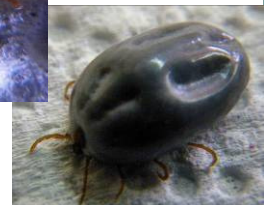
soft body tick >