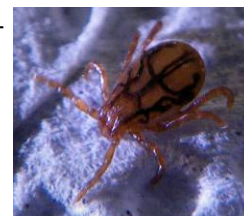
< hard body tick

Ticks Voted (by the editorial staff) "Most Disgusting Critter", ticks are common on Al Asad. Lyme disease is present here, so if you get a tick, use tweezers to remove it promptly and see the TMC just in case. Removal in under 24hrs lessens the chance of problems. Prevent ticks by keeping covered, use bug juice, and checking yourself often. Some ticks wait at the top of foliage for passing mammals, but a few will actually chase the CO2 emitted when animals breathe!