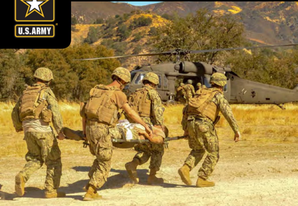
NMCB 4 Seabees perform a four-man litter carry to evacuate a simulated wounded Seabee during their November Field Training Exercise at Fort Hunter Liggett.