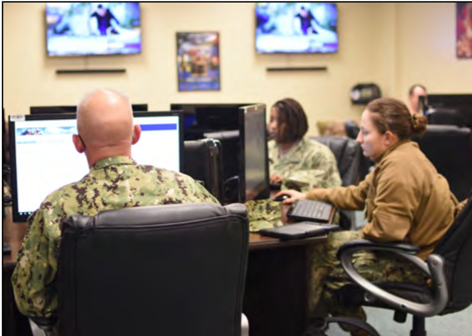
The facility offers services such as most traditional library resources, high-performance gaming computers, and the only Makerspace in the 50-mile radius of post.