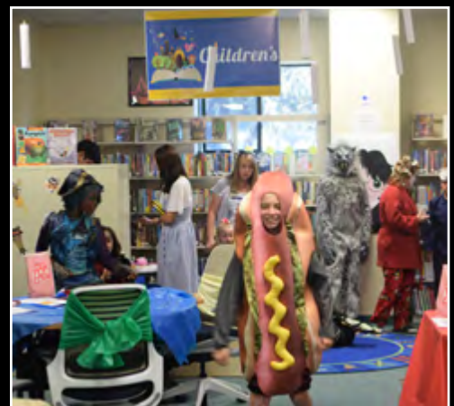
The Cybrary is a multi-use facility hosting special events and meetings.