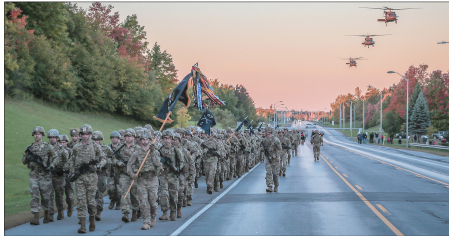
Soldiers from the 2nd Battalion, 14th Infantry Regiment, 2nd Brigade Combat Team, 10th Mountain Division, march at Fort Drum, N.Y., Oct. 5, 2018, to celebrate the participation of the unit in the Battle of Mogadishu.