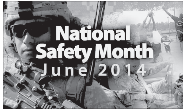
U.S. Army graphic illustration

People also may try to drive when the weather's not very good, he said, and sometimes outdoor events are attended where alcohol is involved, which may lead to poor choices in performing activities requiring "a lot of mental focus or a high