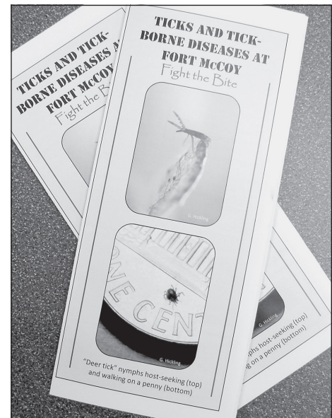
Brochures, such as this one about ticks, are available at the Fort McCoy Safety Office and the Permit Sales Office.

A brochure containing information about ticks found in the area, created by the Natural Resources Branch in partnership with Michigan State University, is available at the Permit Sales office, building 2168, and the Installation Safety Office, building 1678. This brochure, along with information on hazardous plants, can also be downloaded from the Fort McCoy i-Sportsman website at www.mccoy.isportsman.net .