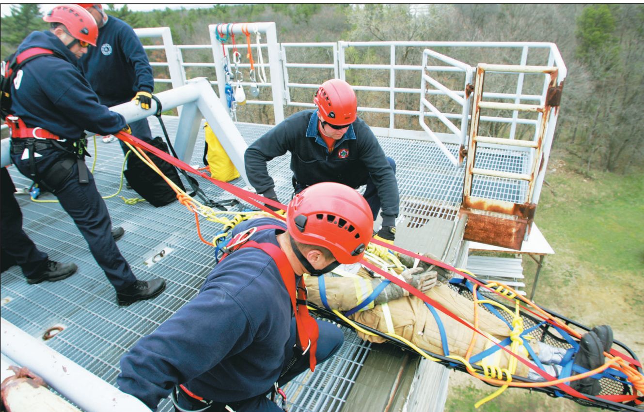
Fort McCoy firefighters participate in high-angle technical-rescue training at a 65-foot-tall rappelling tower in the installation cantonment area. Team members (above) begin to lower a simulated patient while team members on the ground (below) prepare to receive the patient.