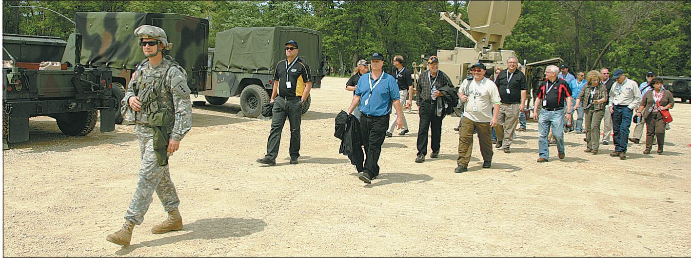
Employers participate in a Boss Lift event with the 32nd Infantry Brigade Combat Team at Fort McCoy's Tactical Training Base Justice.

Deer ticks carry the most common (See PESTS page 9)