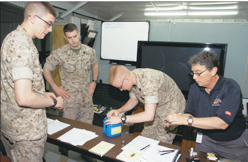
U.S. Navy corpsmen learn how to reset a thermometer for food preparation.

RTS-Medical is a training platform for the medical warfighting function, said Gerry Meyer, RTS-Medical administrative officer. It provides and supports a variety of individual- and section-level medical skills sustainment training and unit-level collective training at Fort McCoy.