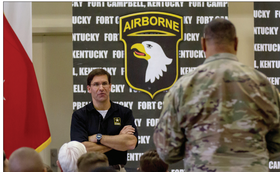
The Secretary of the Army, Dr. Mark T. Esper, receives a question from a Soldier during a town hall meeting on Fort Campbell, Kentucky, July 10, 2018.