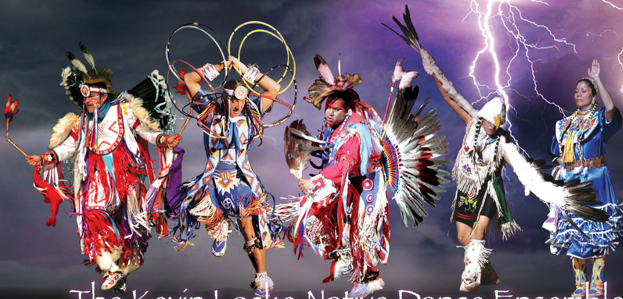
The Kevin Locke Native Dance Ensemble

FOR MORE INFORMATION CONTACT THE MNC-I HUMAN RELATIONS OFFICE AT 485-5061.