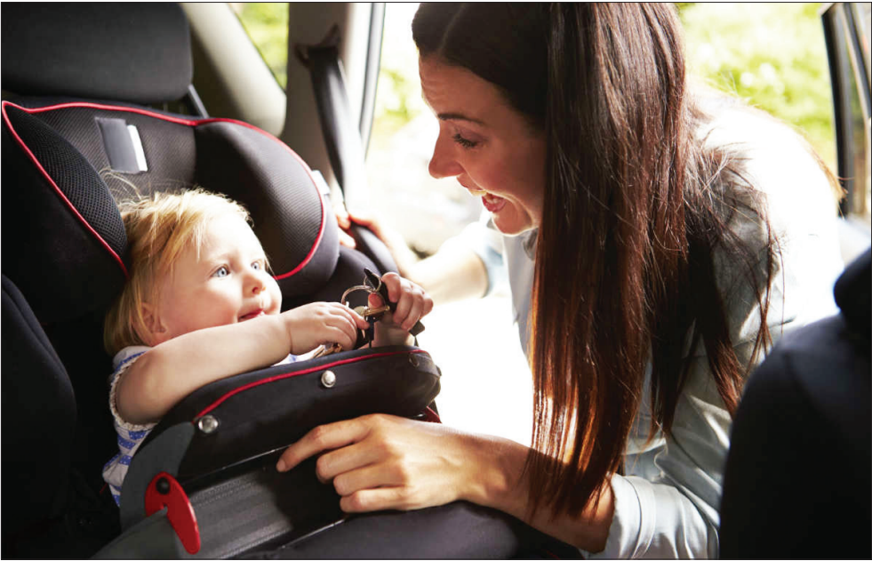
Never leave a child alone in a car, and always look in the back seat before leaving the vehicle. In warm weather, children are at risk of heatstroke.

Infants and young children are sensitive to the effects of extreme heat, and must rely on other people to keep them cool and hydrated.