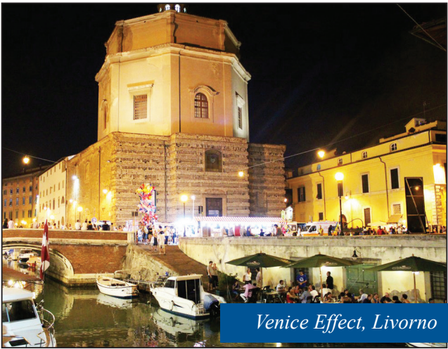
Venice Effect, Livorno

Man Ray – Wonderful Visions Through Oct. 7 , 10 a.m.-7:30 p.m., San Gimignano, Modern Art Gallery, Via Folgore da San Gimignano; 10 a.m.-7:30 p.m. through Sept. 30; 11 a.m.-5:30 p.m., Oct. 1-7. On display More than 100 photos by Man Ray, one of the most important photographers of the XX century. His photographic works encompass fashion, portraits, and technical experimentation. Entrance fee: €9, reduced €7 for children ages 6-17 and for senior citizens older than 65; free access for children younger than 6.