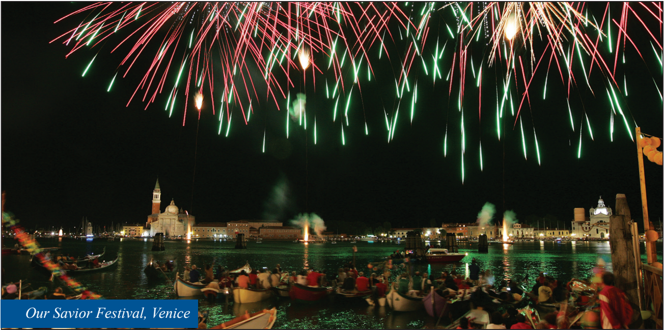
Our Savior Festival, Venice

BeerRrenai/Music Summer Fest Through Aug. 5 , 5 p.m.- midnight, Signa (Florence), Parco dei Renai, Via dei Renai. Food booths feature