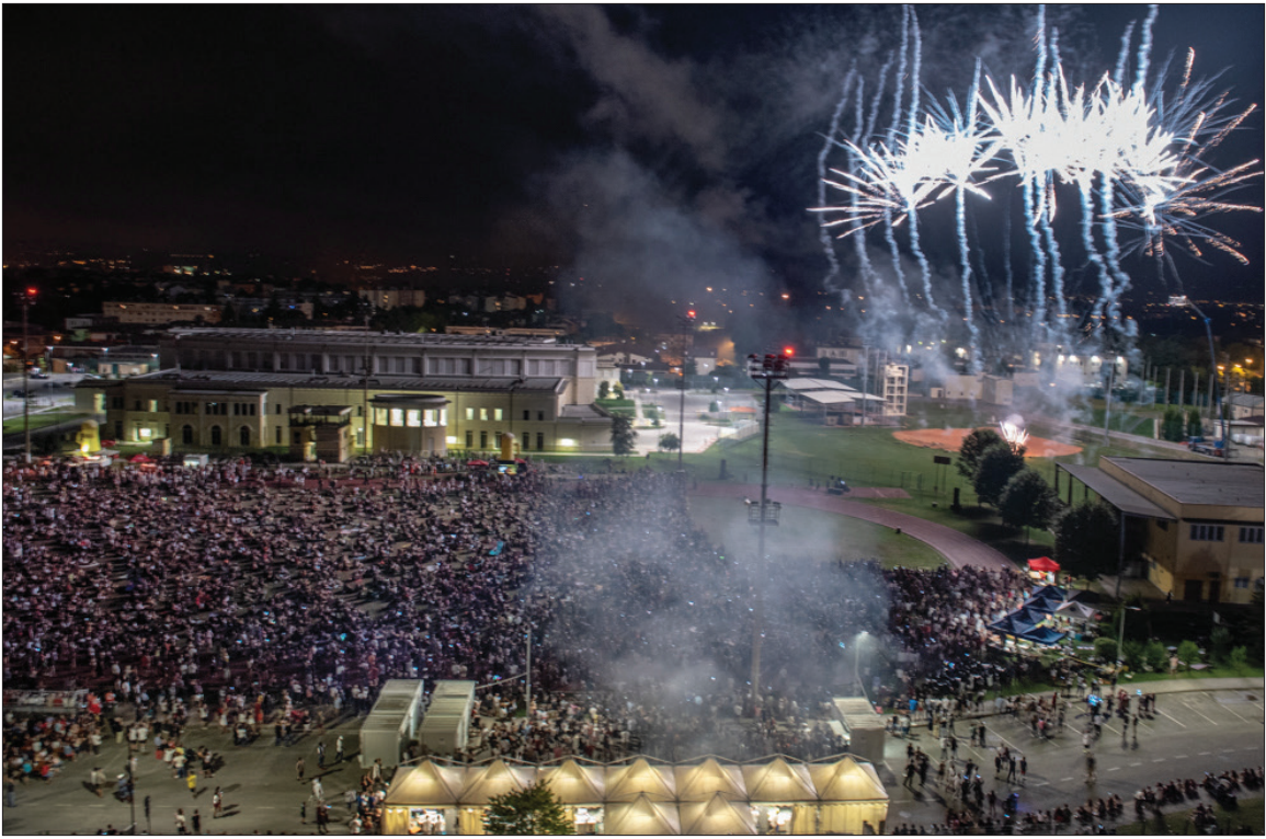
Approximately 19,000 members of the Vicenza Military Community and the local Italian community came out in full force for Independence Day activities on Caserma Ederle July 4. The event, hosted by U.S. Army Garrison Italy, included children's rides, games and activities, food and beverage tents, music and fireworks.