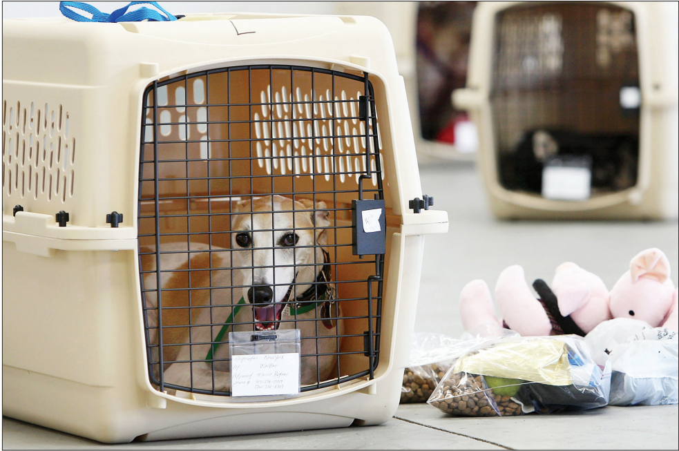
Know before you go. Soldiers and civilians who want to take pets back to the United States with them must plan ahead.