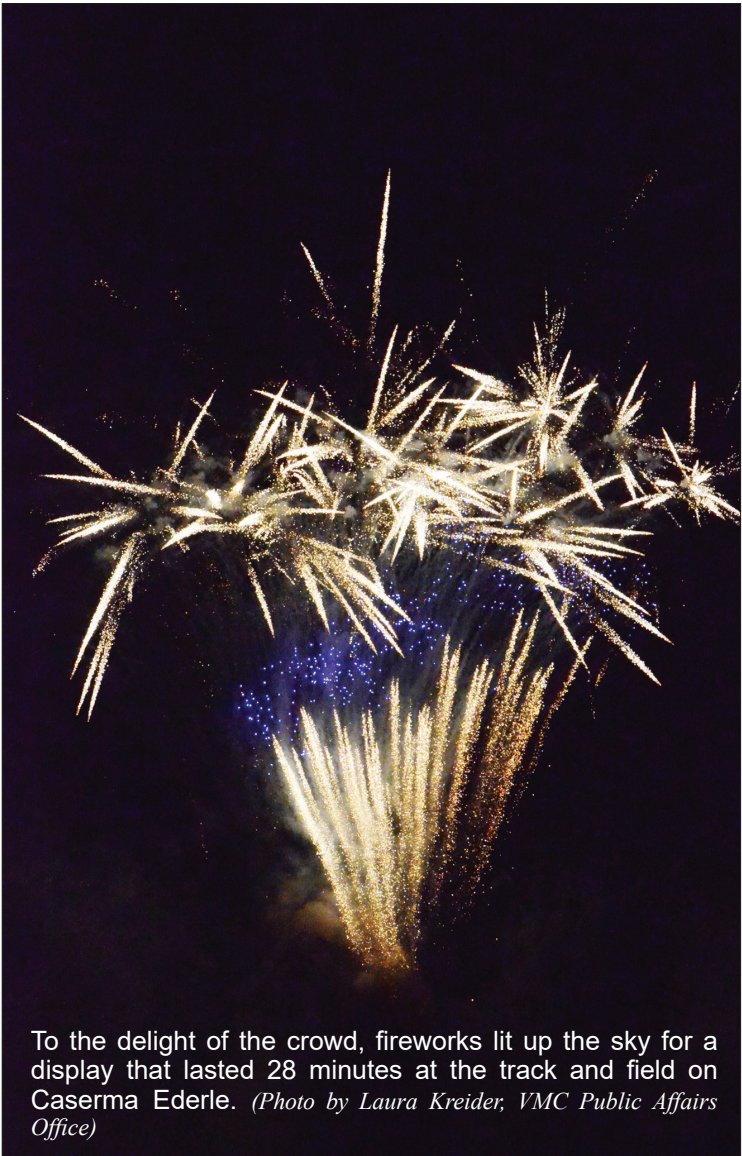
To the delight of the crowd, fireworks lit up the sky for a display that lasted 28 minutes at the track and field on Caserma Ederle.