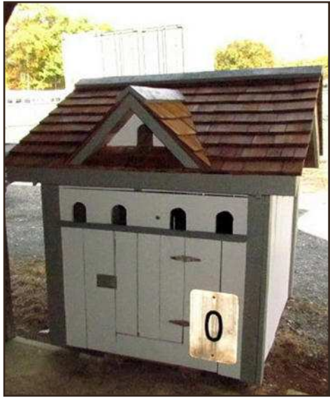
The preserved Building 0 after Environmental Department employees completed the restoration.

BZ to the Environmental Department team for the manpower and to NSWC IHEODTD for providing the funds to help preserve a very significant part of the base's history!