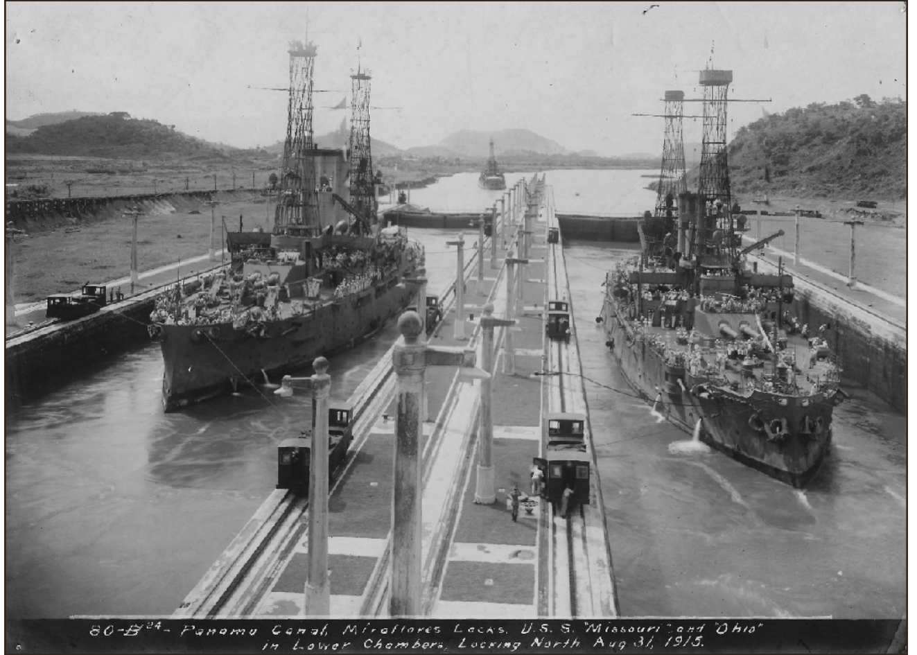
USS Missouri (BB-11), at left, and USS Ohio (BB-12) in the lower chambers of the Miraflores Locks, Panama Canal, Aug. 31, 1915. View looks north, with USS Wisconsin (BB-9) in the distance.

July 20, 1969 — Former Navy pilot Neil Armstrong is the first man to set foot on the moon, saying, "That's one small step for (a) man, one giant leap for mankind." Armstrong is Commander of Apollo 11, which during its 8-day mission lands on the Sea of Tranquility. Michael Collins is the Command Module Pilot and Edwin Buzz E. Aldrin Jr. is the Lunar Module Pilot.