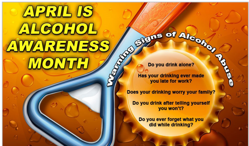
April is Alcohol Awareness Month. The Army Substance Abuse Program, or ASAP, is recognizing the observance by hosting variety of informational and educational events in the community.

Addiction is a chronic, progressive disease that can be linked to family history and genetics. If there is a family history of problems, be straightforward about it as one