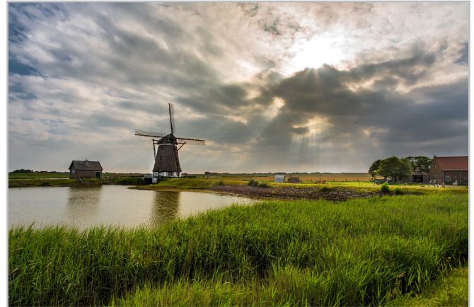
Open-air museums provide visitors an opportunity to see authentic Dutch homes, villages and iconic structures such as windmills.

The Netherlands most famous open air museum, Het Nederlands Openluchtmuseum, is located in Arnhem. Many old and historic buildings from all over The Netherlands, which were on the brink of being torn down, were brought here. Several of the buildings are still "lived in" by museum employees who talk to visitors as if they were the original owners. Old crafts and costumes are on display, and demonstrations are given daily.