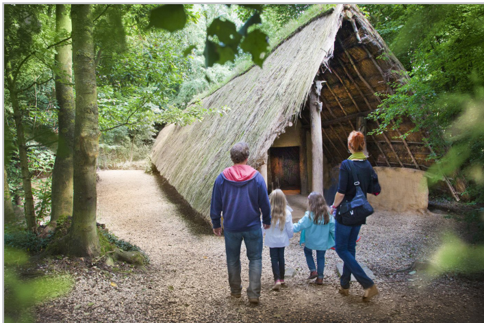
The Archaeological Site of Aubechies is the largest archaeological open-air museum in Belgium. This open-air archaeological park is where visitors can discover the objects of everyday life displayed in the different dwellings.

Openluchtmuseum Bachten De Kupe is a museum near the Belgian town of Izenberge. It is the reconstruction of an old farmer village. It has an old farm, a medical cabinet, chapels, a library and more. Entry is €6 for adults and €3.50 for children age 6 to 12.