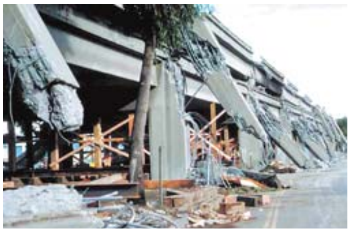
The support-columns of the upper deck of the Cypress viaduct, Oakland, Calif., failed and collapsed after the Loma Prieta earthquake, Oct. 17, 1989.