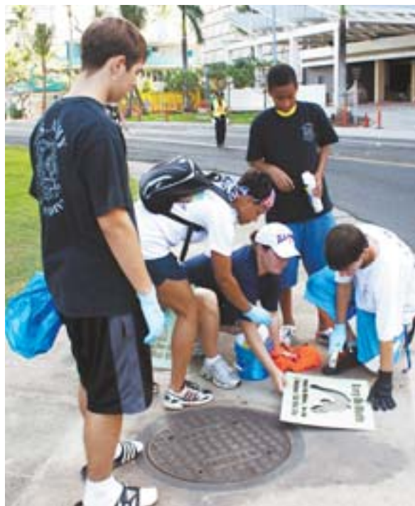
Teams comprised of the 7th Engineer Dive Detachment Soldiers and family members stencil storm water drains on sidewalks around Fort DeRussy to help prevent the illegal dumping of materials. The stencil reads, "Dump No Waste, Protect our Waters. For Life."