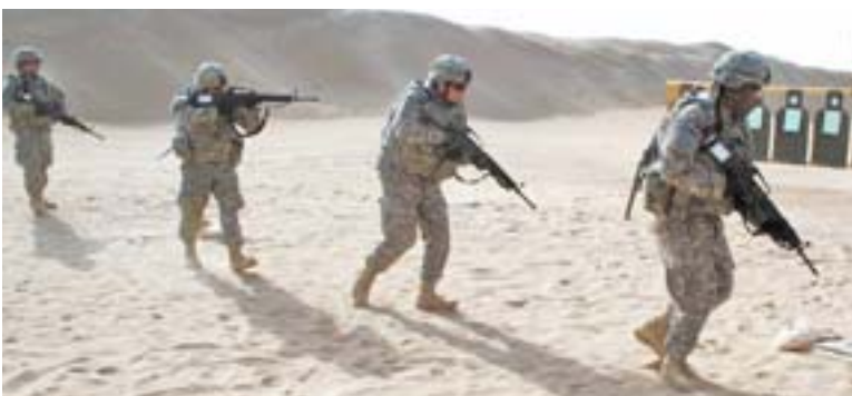
25th Combat Aviation Brigade Soldiers participate in close quarter, squad movement rifle training during live-fire exercises outside of Camp Buehring, Kuwait, Sept. 18.

“The mandatory training includes both administrative briefings and certain tactical training,” explained Louer. “The administrative side includes everything from basic deployment introductions to finance classes.