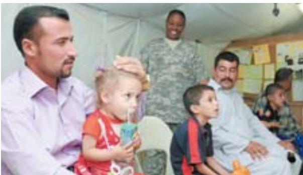
We are performing several different tests to see what the anatomy of their heart is and what kinds of medical