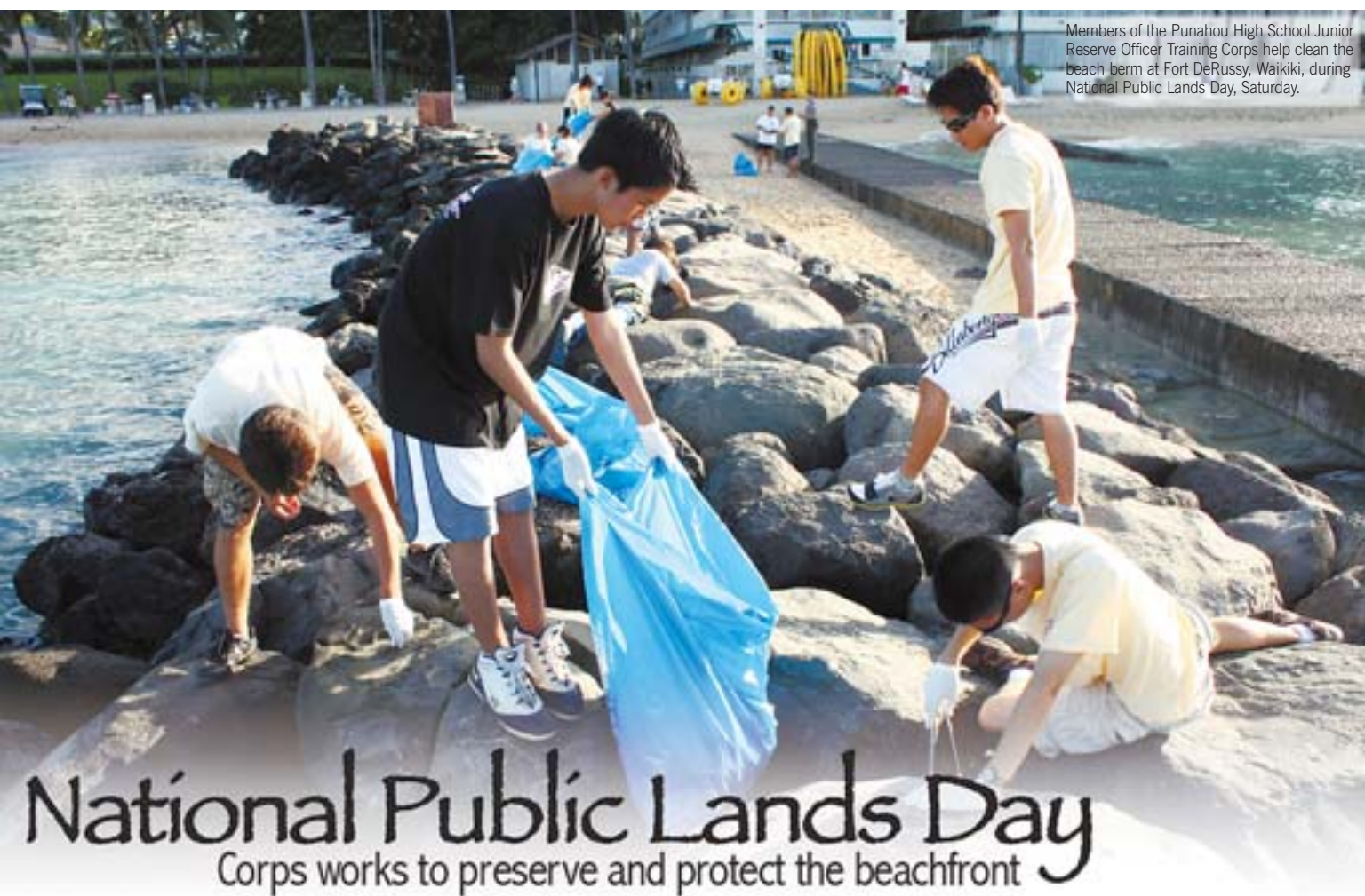
Members of the Punahou High School Junior Reserve Officer Training Corps help clean the beach berm at Fort DeRussy, Waikiki, during National Public Lands Day, Saturday.