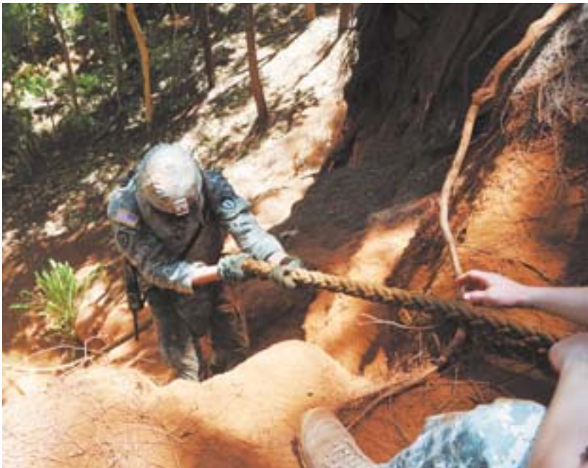
Above — A Soldier in 1st Battalion, 21st Infantry Regiment, 25th Infantry Division, climbs up a steep hill on the obstacle course during he “Gimlet Challenge.”