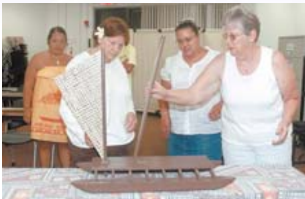
Students learn about Polynesian voyaging canoes during the second week of Hawaiian culture class at Army Community Service, July 22.

Students discover traditional Hawaiian philosophy, such as the "kumulipo," a genealogical chant from