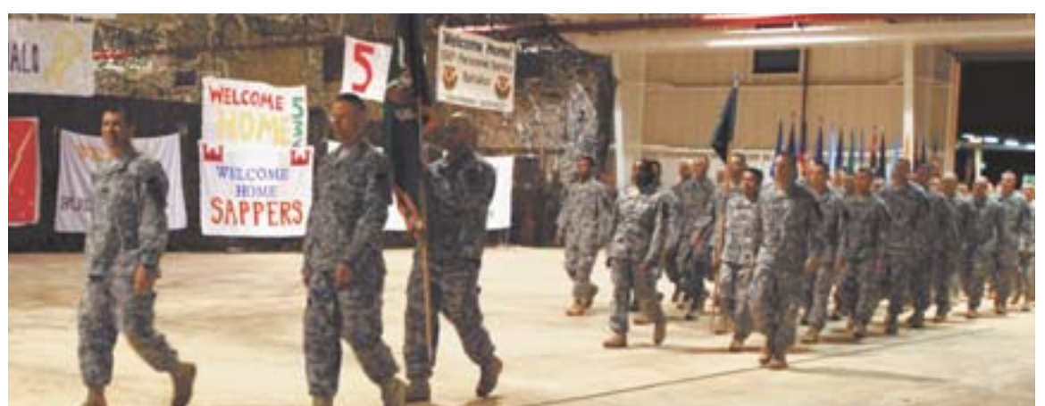
Soldiers of the 728th Military Police Battalion, 2nd Stryker Brigade Combat Team, march into the Multiple Deployment Facility early Tuesday