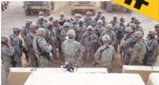
Soldiers of the 523rd Engineer Company receive their mission brief prior to heading outside of the wire to continue construction operation in northern Iraq.

The “Never Daunted” Soldiers enabled the Iraqi landowner to, in turn,