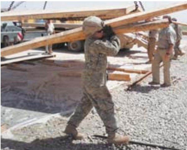
A Soldier helps move lumber for the construction of a new test fire pit on Contingency Operating Base Marez, Mosul, Iraq.

Moving hundreds of Soldiers out of inner-city combat outposts (COPs) was the first challenge, as the 523rd Engineers spent weeks removing U.S. prop-