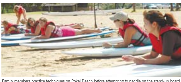
Family members practice techniques on Pokai Beach before attempting to paddle on the stand-up board in the water.

Family members then launched their boards into a steady sea and practiced the techniques. Within minutes, nearly all the participants were standing and paddling like the pros.