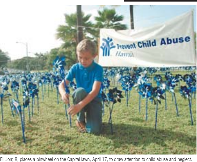
Community volunteers along with Prevent Child Abuse Hawaii and the Child Abuse Prevention Planning Council placed more than 5,000 pinwheels on the lawn to raise awareness. The pinwheels will be on display through April 26.