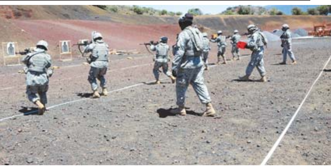
Soldiers from the 254th Combat Service Support Battalion conduct reflexive-fire training at Pohakuloa Training Area, April 14.