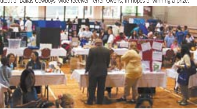
Teaming up with the Pro Bowl Meet and Greet, the Family and Morale, Welfare and Recreation expo provided family members with information regarding programs and