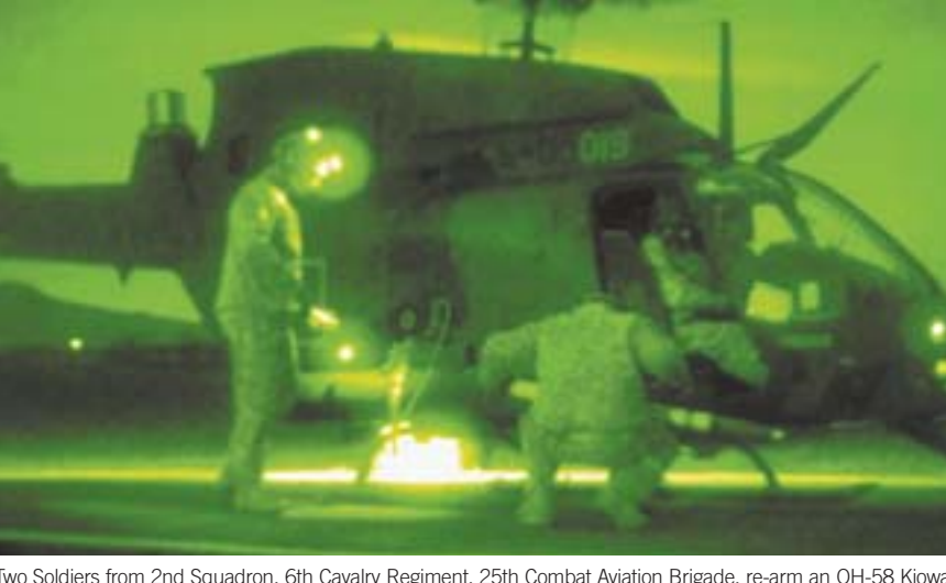
Two Soldiers from 2nd Squadron, 6th Cavalry Regiment, 25th Combat Aviation Brigade, re-arm an OH-58 Kiowa Warrior with rockets during night aerial gunnery and forward arming and refueling point operations at Pohakuloa Training Area, Feb. 5.

A four-point FARP has four separate re-fueling points. When deployed to combat zones such as Iraq or Afghanistan, a four-point FARP is a 24-hour