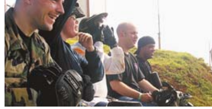
Soldiers from the 2nd Stryker Brigade Combat Team cheer on fellow Soldiers from the sidelines at Paintball Hawaii. The recently redeployed Soldiers participated in numerous games of strategic paintball as part of the Warrior Adventure Quest program.

participate in the WAQ program within the first 90 days of returning home.