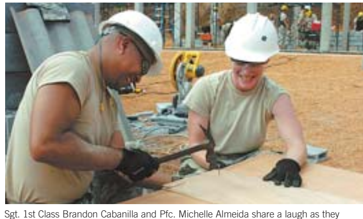
prepare window frames for the new classroom facility

"While the building is important, the more important facet to the exercise is