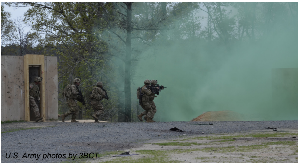
Soldiers from 3rd Brigade Combat Team, 10th Mountain Division (LI) move between buildings using smoke as concealment to clear a village during a training exercise at Fort Polk, La.