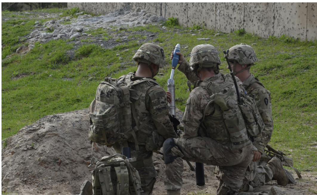
A mortar team from 3rd Brigade Combat Team, 10th Mountain Division (LI), fires simulated mortar rounds to fend off an enemy advance during their combined arms live-fire exercise at The Joint Readiness Training Center on Fort Polk, La.