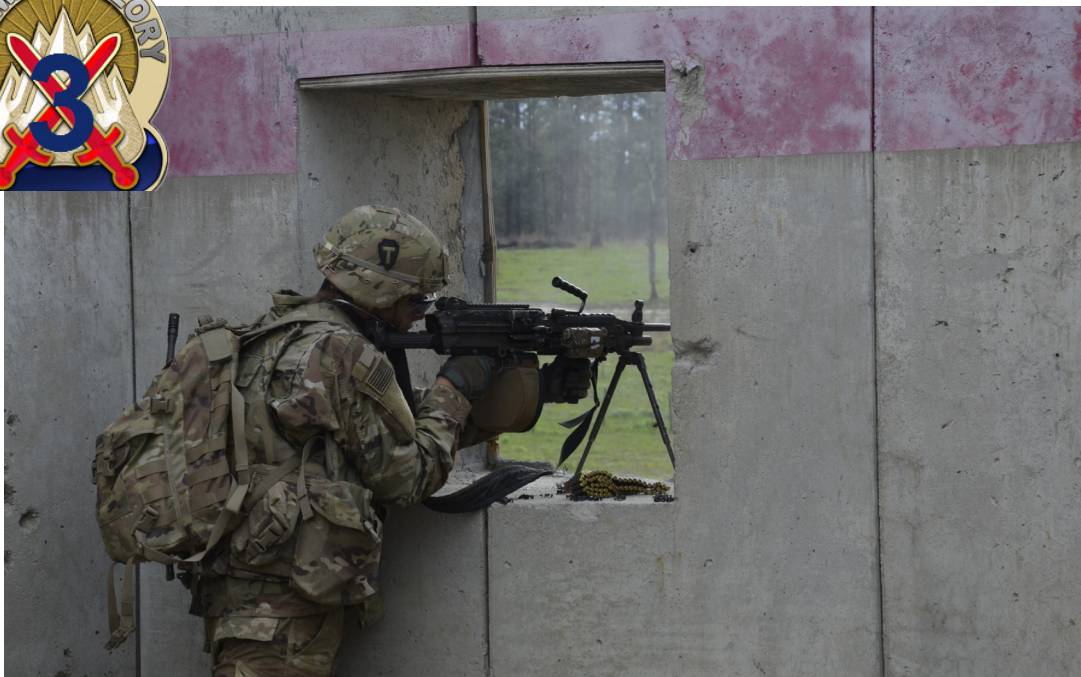
An M249 SAW gunner from 2nd Battalion, 2nd Regiment, 3rd Brigade Combat Team, 10th Mountain Division (LI), returns fire to suppress an enemy counter-attack during a combined arms live-fire exercise at Fort Polk, La.