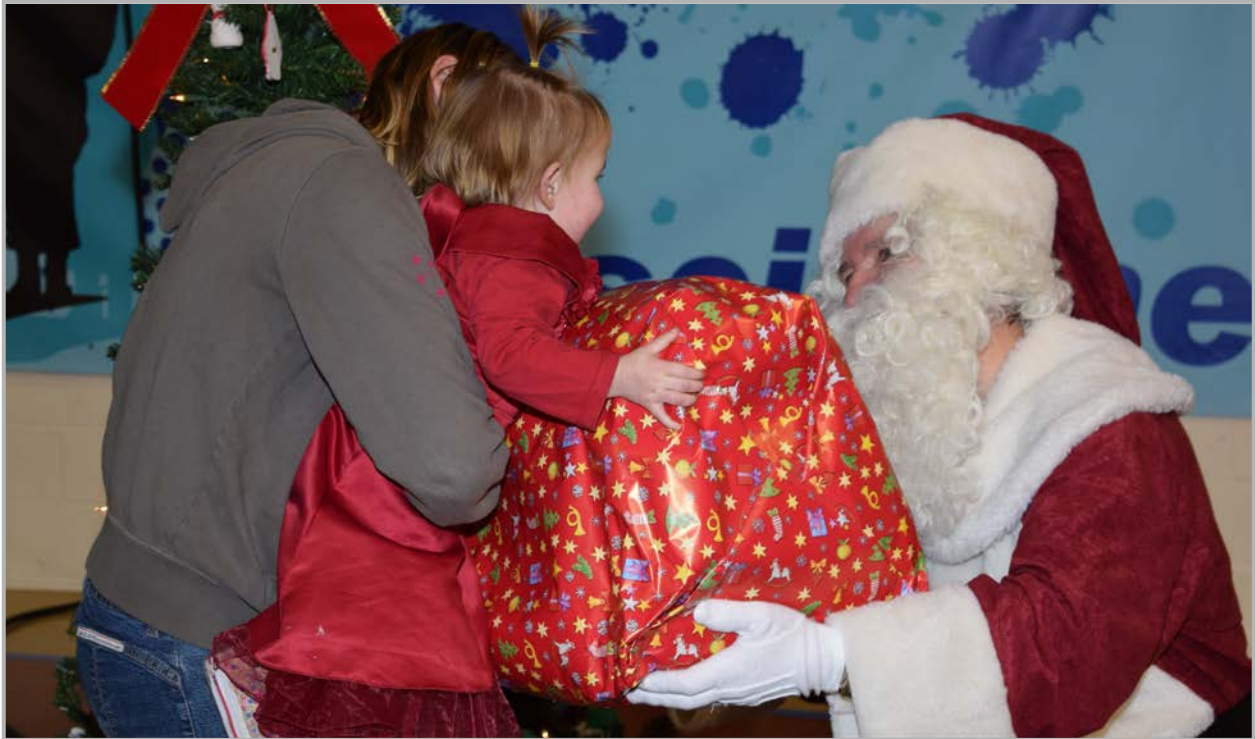
Santa makes a merry Christmas possible for the children of La Fermette, the local orphanage in Ath.

Christmas is around the corner, and the children of the local orphanage La Fermette in Ath are ready for a visit from Santa.