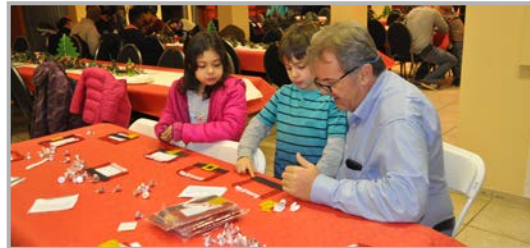
Families make holiday crafts as they wait for Santa Claus in the 3 Star Recreation Center in Brussels, Dec. 1, 2017.