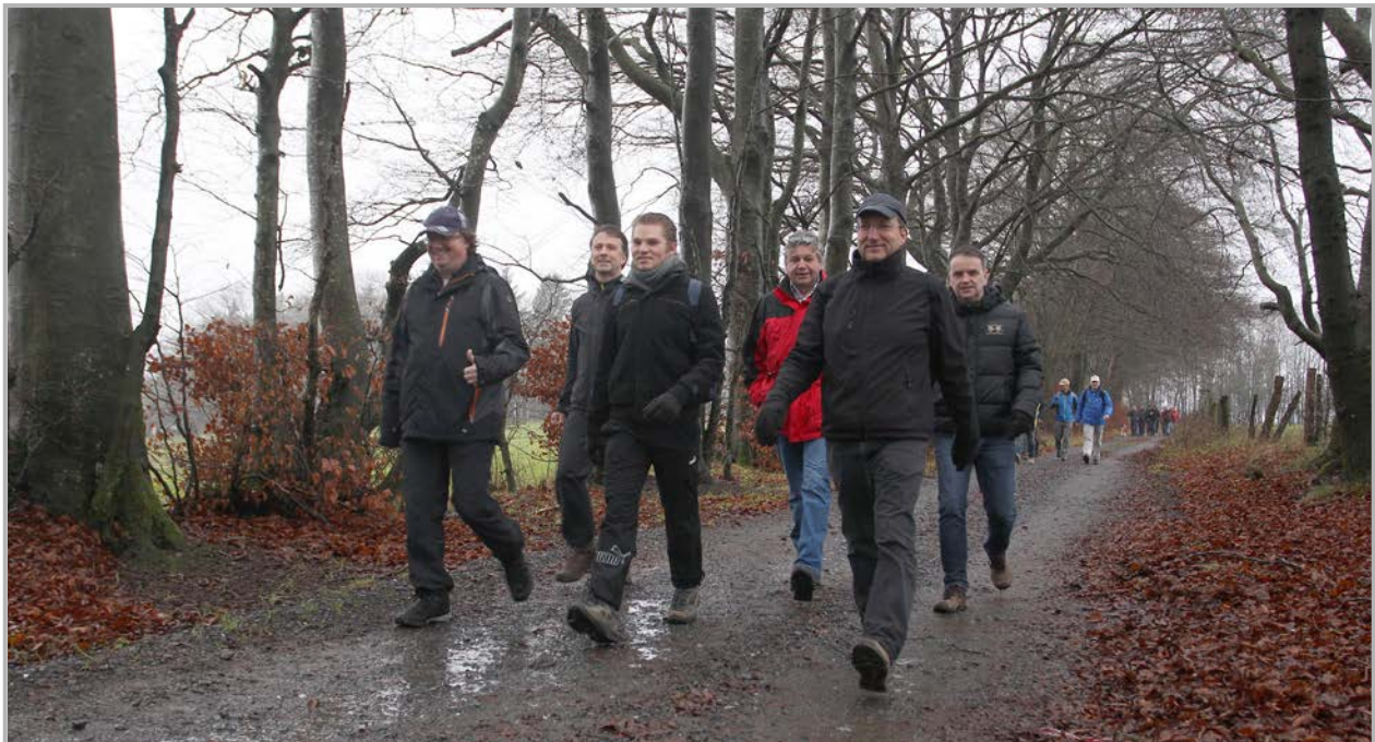
Participants of the annual walk have the choice between three distances: seven, 14 and 20 kilometers.

In addition to the walk, a patriotic parade will begin at 3 p.m. on Dec. 16 as well as a wreath-laying at the Patton and McAuliffe monuments. In honor of Army Brig. Gen. Anthony McAuliffe's famous quote "Nuts!" nuts will be thrown from the city hall balcony at 4 p.m.