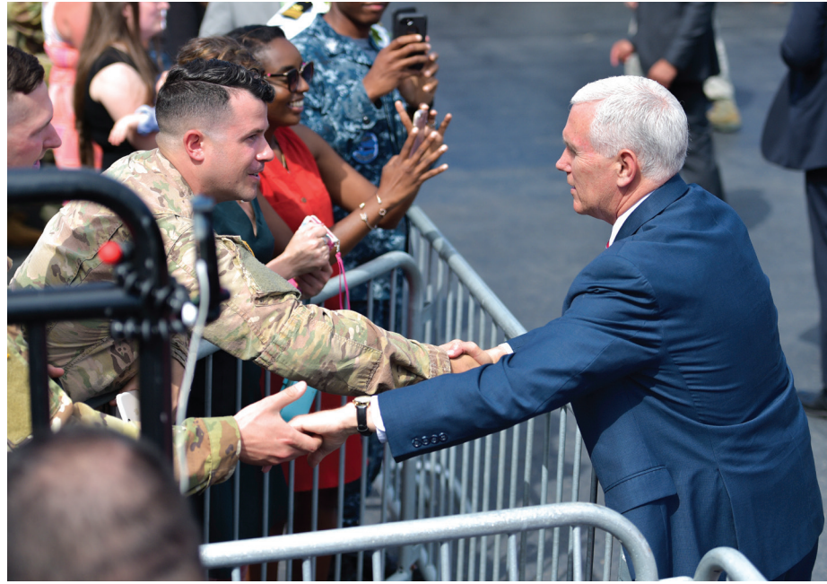
Vice President Mike Pence shakes hands with members of the 25th ID stationed at Schofield Barracks as he prepares to depart for Washington D.C. from Joint Base Pearl Harbor-Hickam, April 24.

The 25th Infantry Division continued to add to its storied history in 2017 and stands ready to answer the nation's call if needed. As 2018 begins, readiness will continue to be the focus as the Division proudly stands as America's Force in the Pacific.