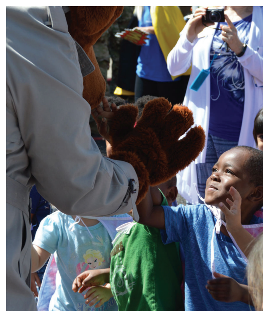
Children gather around McGruff the Crime Dog at the 2017 Child Abuse Prevention Month Parade.