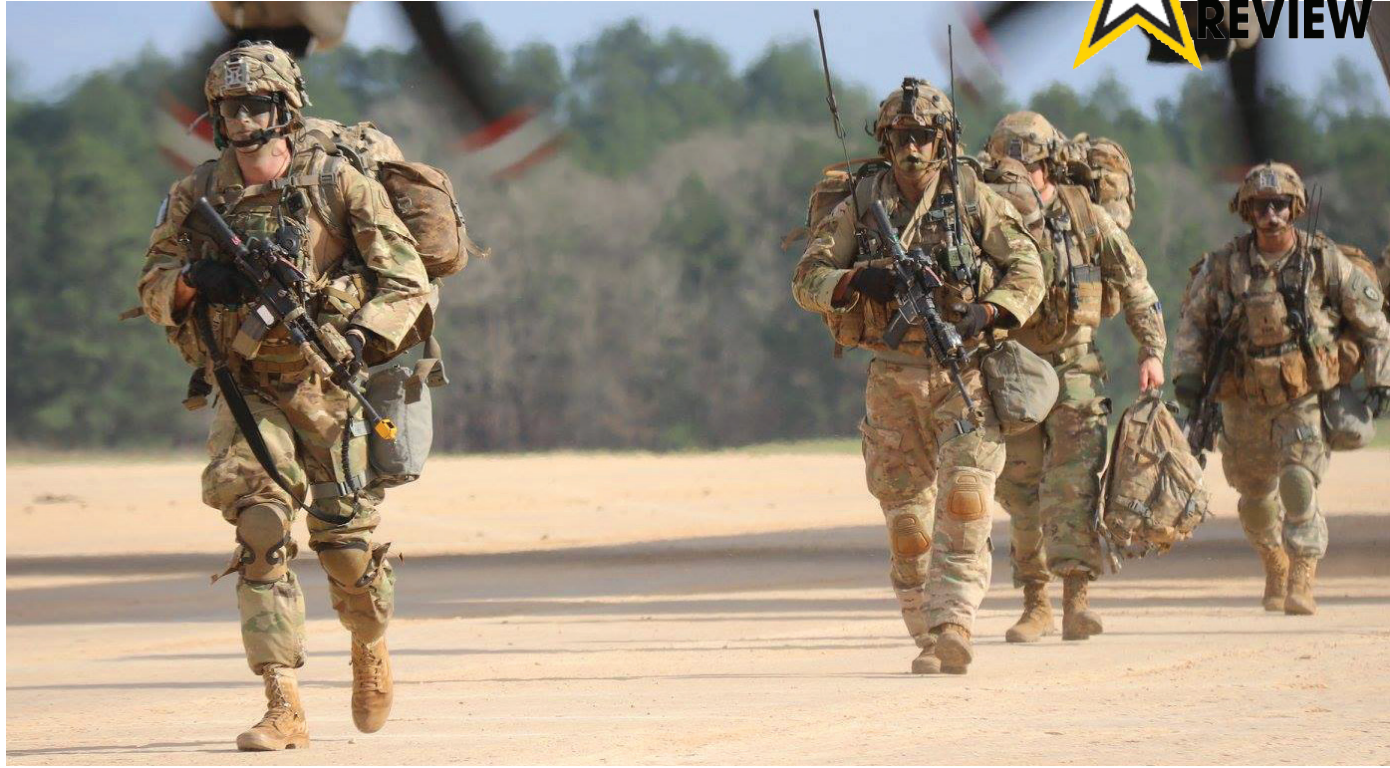
FORT POLK, Louisiana — Soldiers assigned to 1-21st Inf., 2nd IBCT, 25th ID, arrive on the Geronimo DZ, Feb. 12, during rotation 17-04 at JRTC.