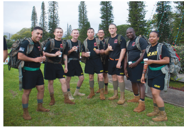
Above — Soldiers take a break with refreshments after their ruck to General Loop, where they donated toys to the Institute for Human Services, a local agency that serves the homeless in Hawaii.