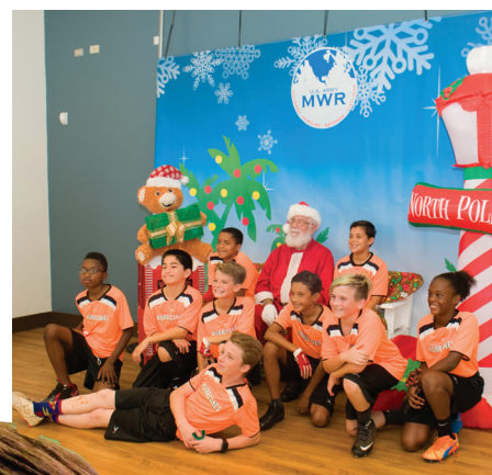
The Schofield Barracks Hurricanes, a youth sports team, pose with Santa Claus.