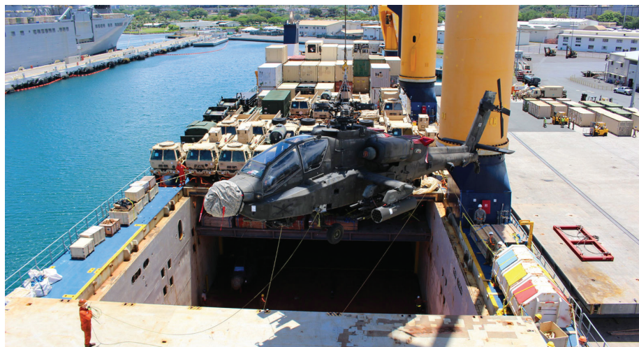
The forward ship's crane on the M/V Ocean Jazz lifts an Apache helicopter into the hold during port operations at Pearl Harbor on June 12.

This movement was delayed for about a week when the ship originally scheduled to conduct the move experienced