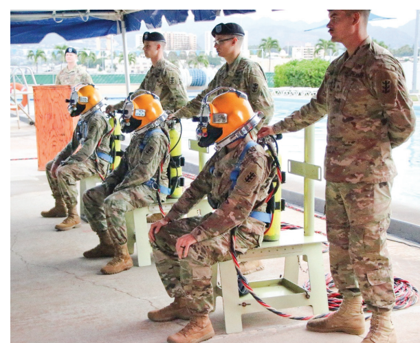
Members of the 7th Eng. Dive Det. command team await commands from the ceremony's dive supervisor during the unit's change of command ceremony, Dec. 8.

The 7th Engineer Dive detachment supports the entire Pacific Theater area of responsibility spanning over 36 countries and 16 time zones.