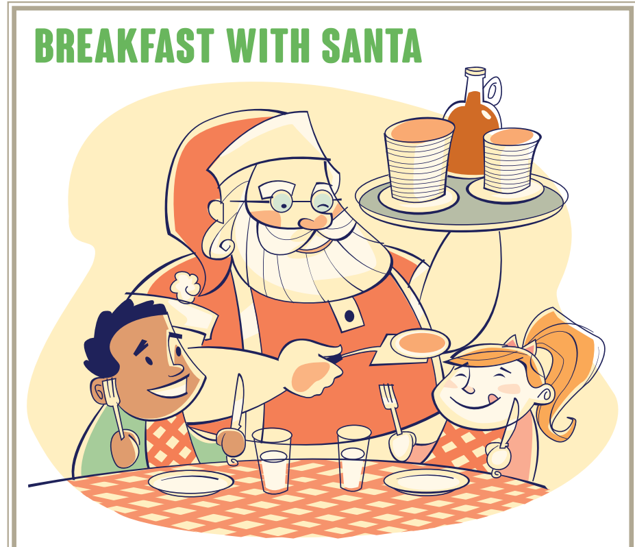
DEC. 9 – Pearl Harbor Navy Exchange patrons can enjoy food and games from 8 to 9 a.m. at the annual Breakfast with Santa on the NEX food court lanai. The event will also feature glitter tattoos, balloon art, holiday card-making, arts and crafts and prizes. The event will include a pancake and bacon breakfast, goodie bags and a framed picture with Santa. The cost is $12 for children and $8 for adults. The event is open to authorized patrons only. Tickets go on sale this weekend. FMI: 423-3287.

NOV. 29 - A parent-child communication class will be held from 1 to 3 p.m. at Military and Family Support Center Pearl Harbor. The