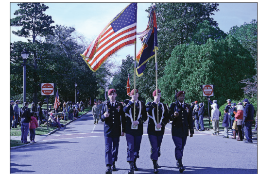
49th Public Affairs Detachment - Soldiers assigned to 3rd Brigade Combat Team, 82nd Airborne Division, march in the 5th Annual Veterans Day Parade in Southern Pines, N.C., Nov. 11, 2017.