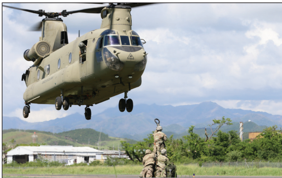
Above Combat Aviation Brigade, 1st Armored Division, conducts sling-load training in Ponce, Puerto Rico, Oct. 31, 2017, in support of relief efforts following Hurricane Maria.