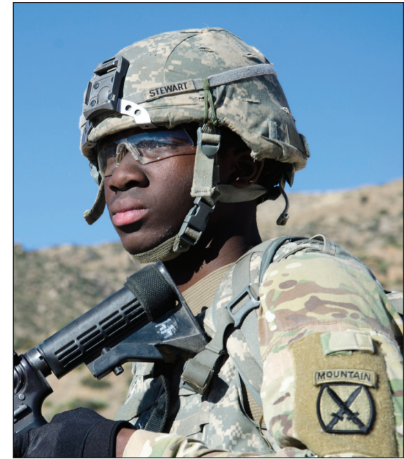
Right A 10th Mountain Division Soldier stands watch from a location in the mountains overlooking White Sands Missile Range during Exercise Vigilant Shield, Nov. 2, 2017.