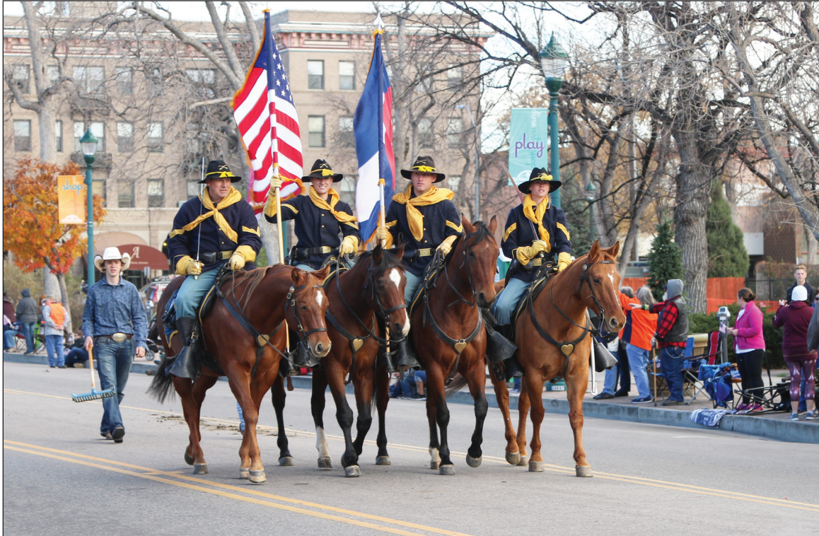
Left A team from the Fort Carson Mounted Color Guard leads the Colorado Springs Veterans Day Parade in downtown Colorado Springs, Colo., Nov. 4, 2017.

Here are the best photos from FORSCOM Public Affairs professionals world-wide. For more photos and information, click these photos or visit army.mil/forscom