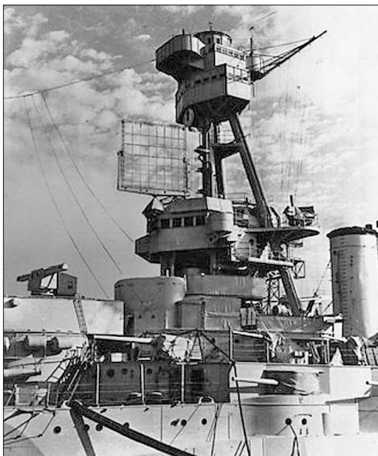
U.S. Naval Research Laboratory

Sept. 27, 1922 - Report on observations of experiments with short wave radio at Anacostia, DC, starts Navy development of radar.