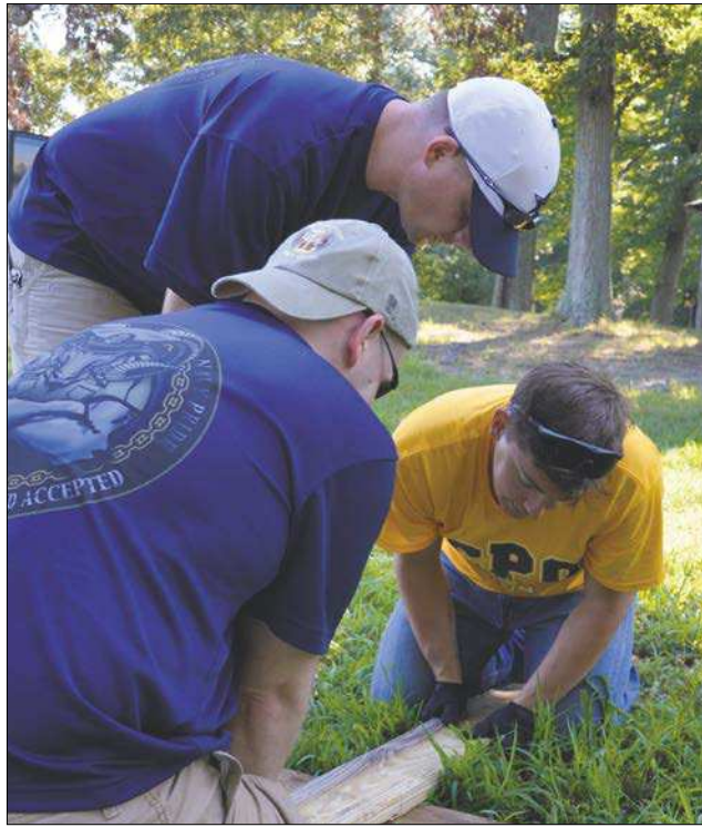
CSCS CPO selectees and current chiefs work together to construct a kayak rack at the Caledon State Park in Dahlgren Va.

The bonus of the new assets at the park is that families will be able to enjoy the fruits of their labor at Caledon, which offers miles of hiking and biking trails and a canoe and kayak launch into the Potomac River. The staff at Caledon are grateful for the assistance with these larger scale projects that improve the park.